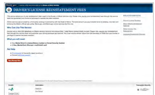
Driver's License Reinstatement Fees