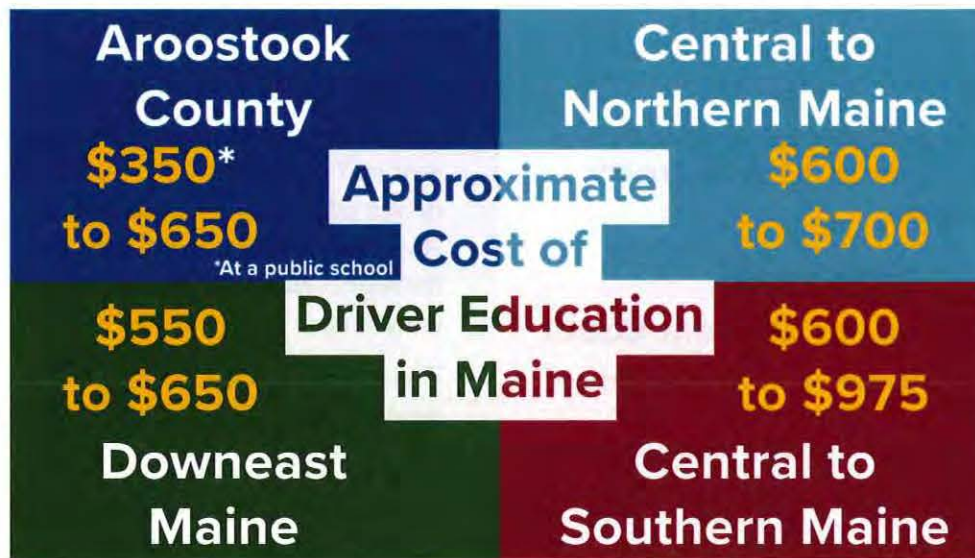
Figure 1-5: The approximate cost of Driver Education in Maine by area.

Aroostook County covers: Ashland, Caribou, Easton, Fort Kent, Houlton, Limestone, Mars Hill and Presque Isle.