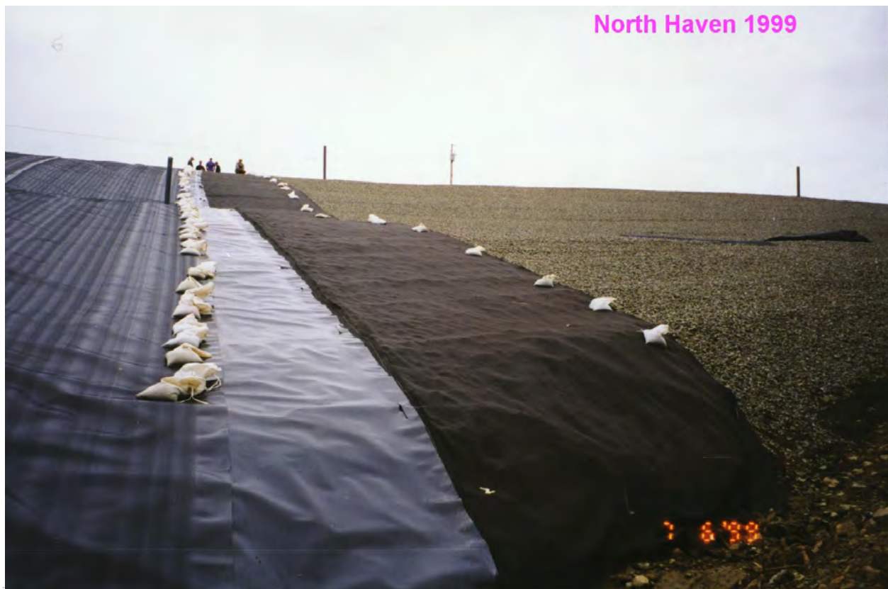
Figure 2: Capping the North Haven Landfill in the Summer of 1999