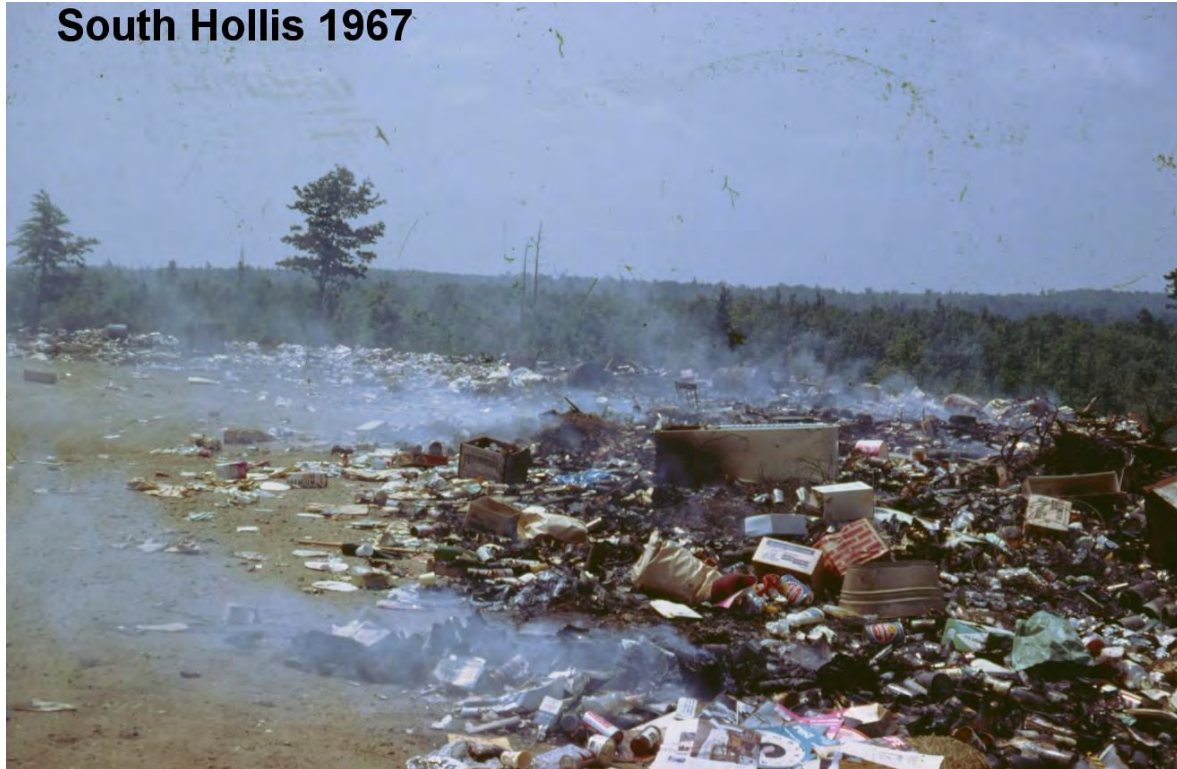
Figure 1: A Typical 1960's Maine Landfill that Sparked Establishment of the Program