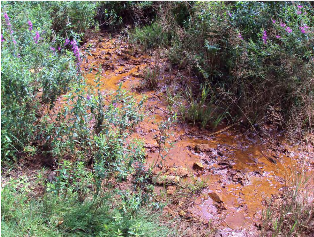
Figure 7: Leachate Breakout Near the Portland Trails Pathway, Ocean Ave Landfill, 2009

implementation of limited field investigations. This activity is to determine that the caps, gas mitigation systems, and other elements of the closure system are being maintained and are functioning as intended. DEP's technical assistance to municipalities is crucial to determining when remedial actions are necessary to protect human health, and when unnecessary actions would only create needless cost. Our experience has been that local historical memory of these sites lasts for about 25 years after landfill closure due to changes in the local population. In the long term, the DEP will become the repository of site knowledge for developers inquiring as to the nature of the site and its potential impact to the surrounding area.