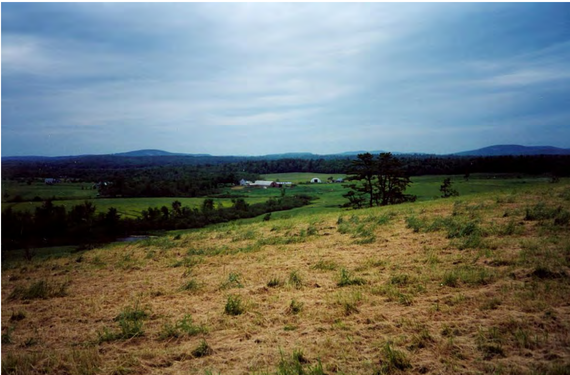
Figure 3: Closed Municipal Landfill in Belfast, Maine, 2000