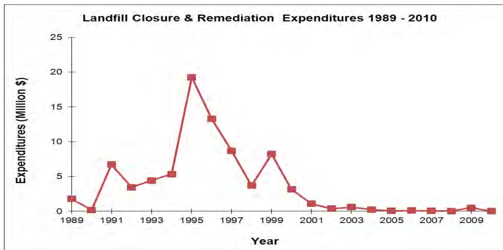
Figure 6: Landfill Closure & Remediation Expenditures – 1989 to 2010

Closure: The State expended approximately $79,000,000 to match some $26,000,000 in municipal funds to close municipal landfills. The distribution of State expenditures on an annual basis is depicted in Figure 6; most of the spending corresponds to the peak years of closures (1993-1997, see Figure 4 on page 7). The state match for closure only applied to closure activities that municipalities incurred prior to December 31, 1999. At this time, all the State match obligations to municipalities for closure activities have been paid. However, P.L. 2011, c. 435 recently extended state match obligations for closure to select landfills, as discussed below.