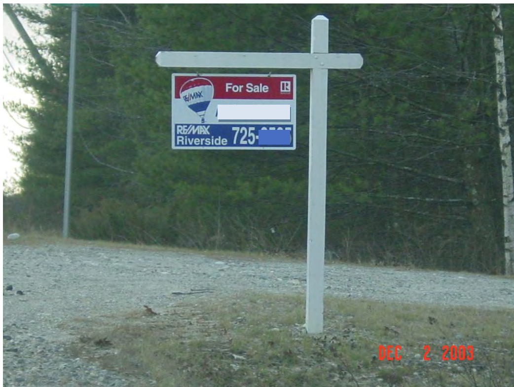
Figure 8: Development Pressure has Increased Near Closed Landfills

Between 1988 and 2000 DEP's Municipal Landfill Closure and Remediation Program oversaw the expenditure of $79,000,000 in State match funds on the successful closure of 397 unlined municipal landfills. The DEP anticipates expending another $3,390,000 for the closure of 5 more landfills. These actions complemented the development of modern day landfills under the DEP's Solid Waste Rules. Since 2000, the Municipal Landfill Closure & Remediation Program has incurred an additional $2,574,034 in match obligations for remedial actions near these closed municipal landfills, and anticipates incurring another $935,000 in match obligations through CY 2015 for additional remedial actions. The total unmet State match obligation to Municipalities through CY 2015 is estimated to be $6,899,034, plus DEP staff costs to provide technical support and other oversight activities.