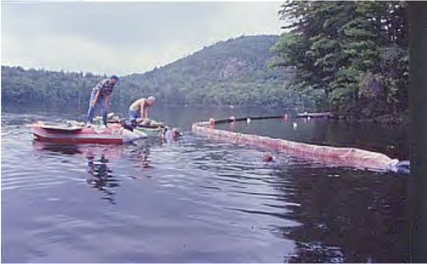
Variable milfoil hunt on Cushman Pond in Lovell, Maine.

Appendix B describes what state agencies, interagency groups, organizations and other partners are doing to implement the provisions of this important new law and carry out other state and federal initiatives to prevent, detect, and control the introduction and spread of invasive aquatic plants. A January 2002 report from DEP and DIFW to the Legislature titled, Invasive Aquatic Species Program Report provides a detailed account of these activities. 19 See also DEP and DIFW websites: http://www.state.me.us/dep/blwq/topic/invasive.htm and http://www.state.me.us/dep/blwq/topic/invasive.htm