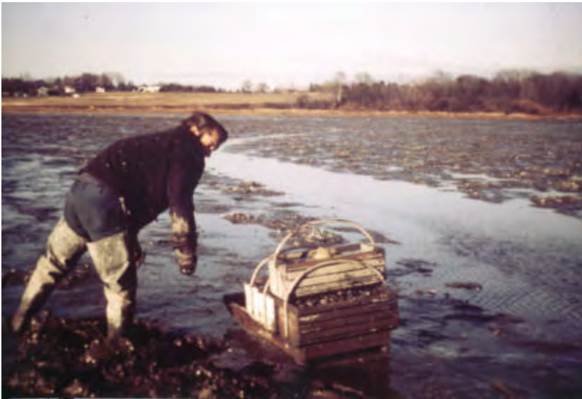
Diggers compete with the green crab for softshell clams.