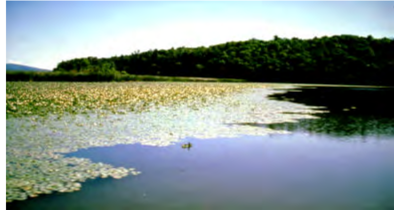
Water chestnut on Lake Champlain in Vermont

The department and its partners were on the verge of successful control, though not eradication, when funding was withdrawn for a second time in 1989. This lapse allowed the infestation to reoccur substantially, requiring an even greater effort when funding was rejuvenated. Now with the lake once again at a crucial point of "remission," department staff hopes that this time the commitment will remain stable.