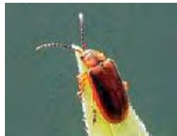
Loosestrife-eating beetle

The Advisory List of Invasive Aquatic Species , located in Appendix D, is the result of this analysis. Please note that while the label "species" is used in the table for purposes of simplicity, the list also includes organisms that are not considered species, e.g. viral pathogens.