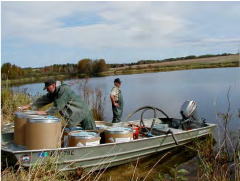
DIFW Biologists prepare to apply rotenone to eradicate illegally introduced smallmouth bass from Durepo Lake near Limestone.

Smallmouth bass were introduced into Umbagog Lake in 1985 and have spread throughout its tributaries, including the Rapid River where they may eventually out-compete and eliminate the renowned brook trout fishery. Because this invader has become so well established and cannot be eradicated in the Umbagog Lake system, Inland Fisheries and Wildlife regulations now encourage people to take as many as possible from the lake, as well as in