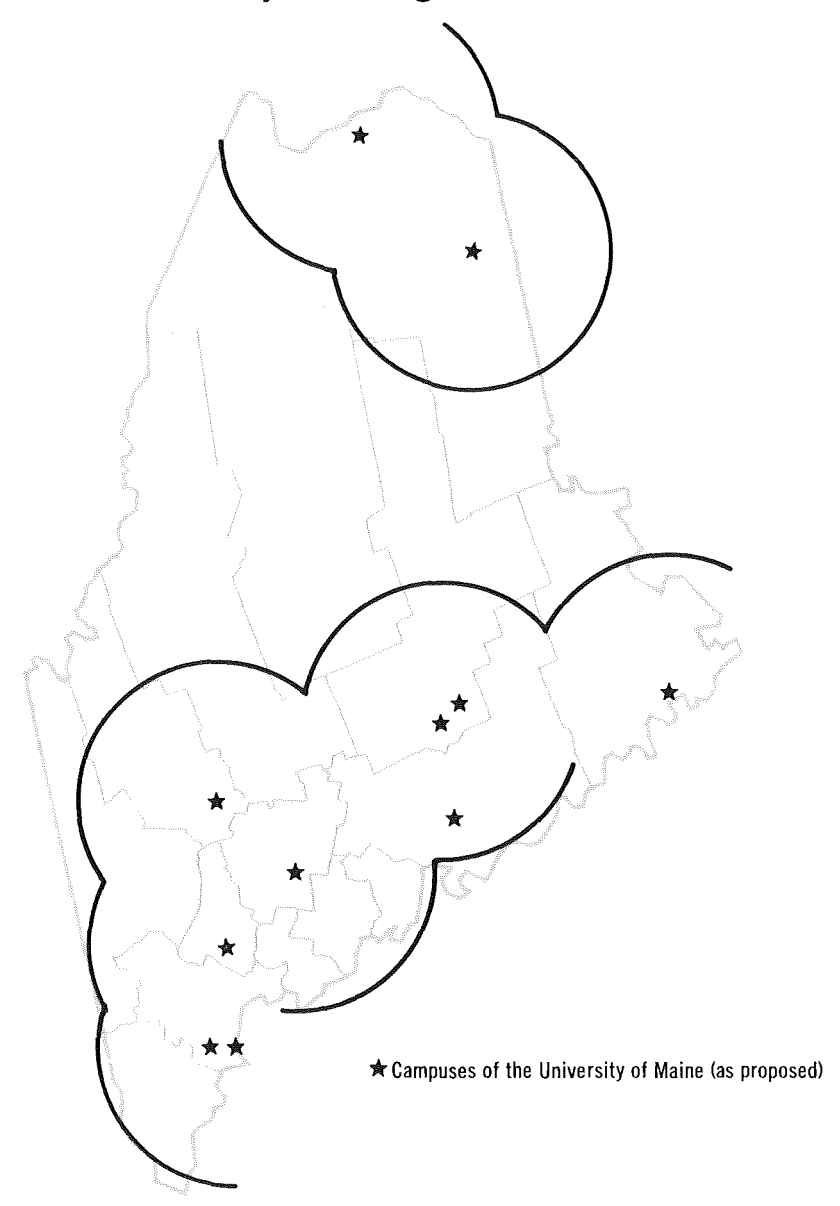
CHART 3 Areas Served by Public Higher Education in Maine