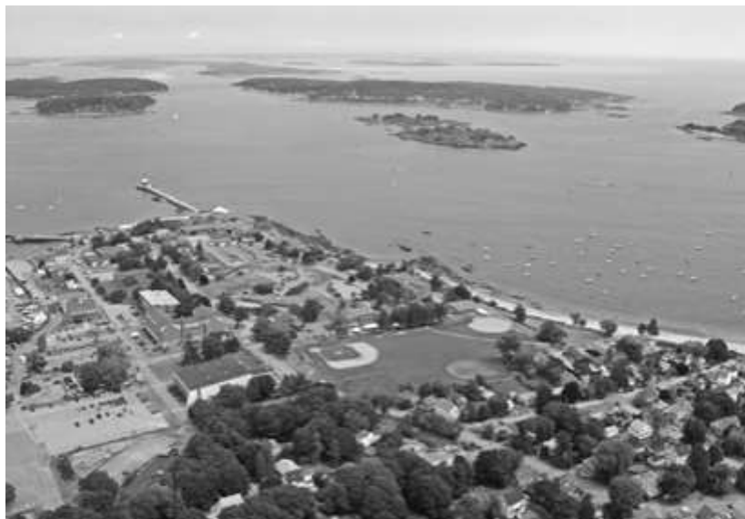
Southern Maine Community College Campus