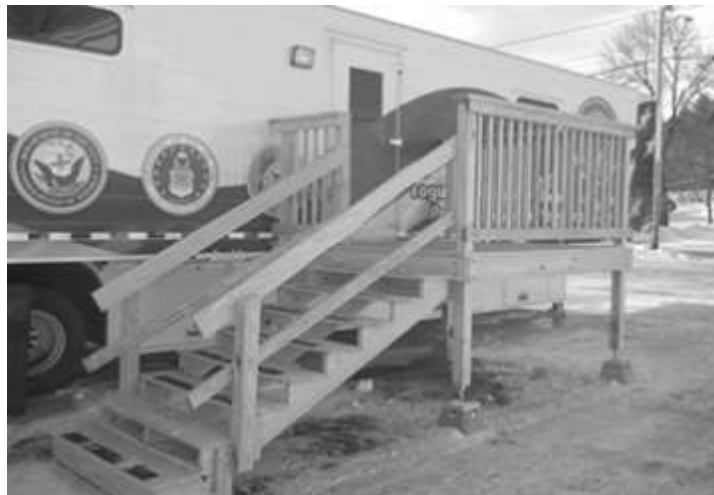
The Bingham, Maine Access Point Mobile Clinic

Checking Accounts (“Share Draft” accounts at credit unions) are transaction accounts —