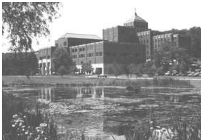
USVA Togus: The nation’s first federally-chartered veterans’ hospital

If you’re a current or former member of the Reserves or National Guard, you must have been called to active duty by a federal order and completed the full period for which you were called or ordered to active duty. If you had or have active-duty status for training purposes only, you don’t qualify for VA health care.