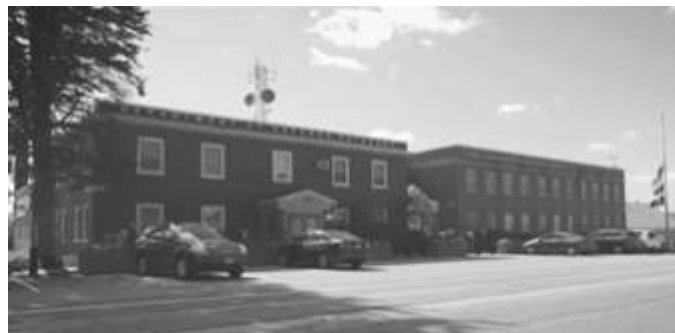
MBVS Office, Augusta, ME