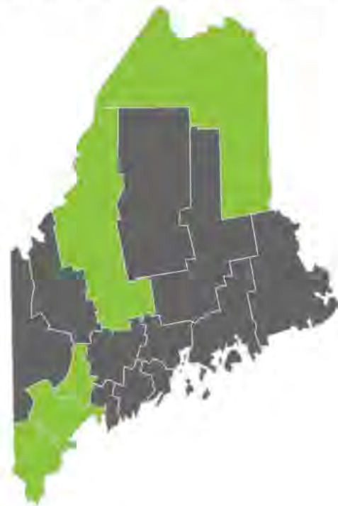
Sample counties selected for statewide study

Limitations of time and resources prevent most indigent defense evaluations from considering every court, public defense system, and service provider in a given state, and so this study looks closely at a representative segment of services throughout Maine. On June 19, 2018, the Joint Legislative Judiciary Committee selected the following counties as a representative sample of Maine’s diversity in population size, geographic location, and methods of providing indigent legal representation: Androscoggin, Aroostook, Cumberland, Somerset, and York. The