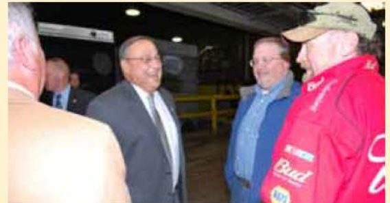
Governor LePage meets with East Millinocket mill workers back on the job

From January 2011 to March 2012, Maine's private sector grew by 4,100 jobs*