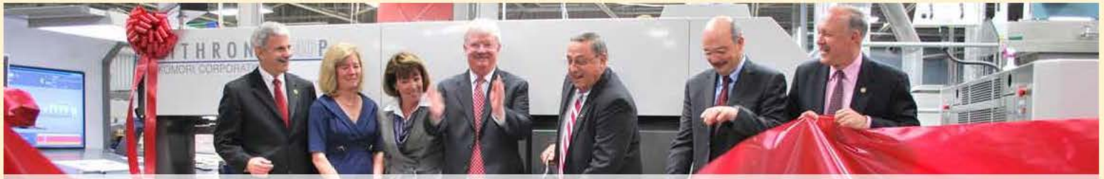
Governor LePage at J.S. McCarthy in Augusta celebrating the installation of a new printing press and the creation of nearly a dozen new jobs.