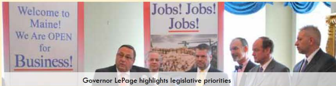
Governor LePage highlights legislative priorities