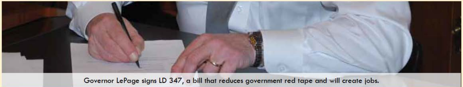
Governor LePage signs LD 347, a bill that reduces government red tape and will create jobs.