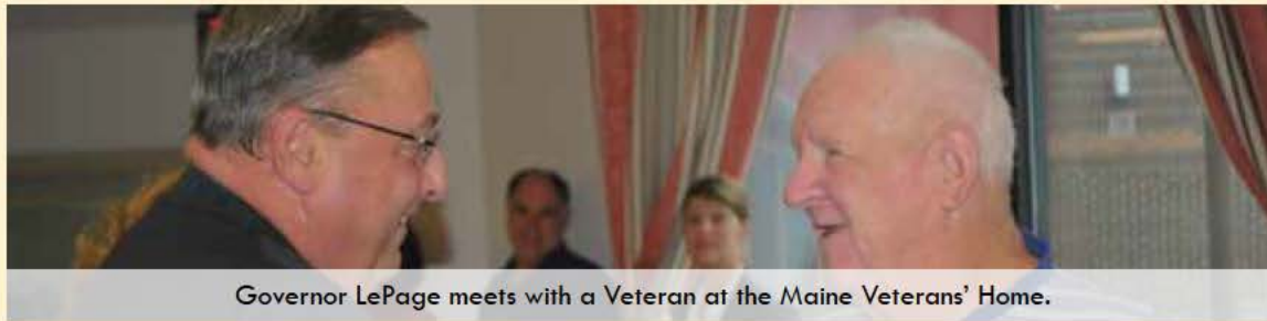
Governor LePage meets with a Veteran at the Maine Veterans' Home.