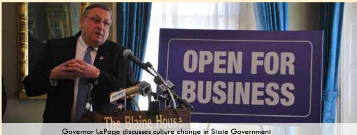
Governor LePage discusses culture change in State Government