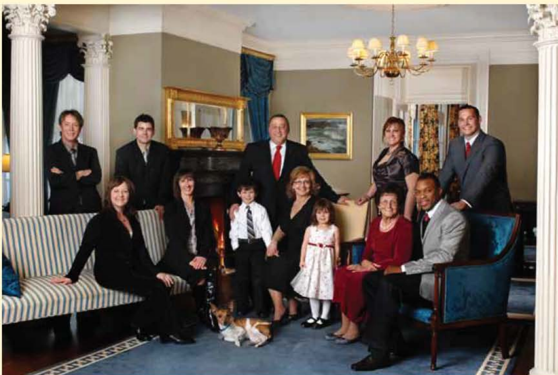
Photo of the LePage family gathered at the Blaine House, April 2011

"If it is to be, it is up to us to move Maine forward."