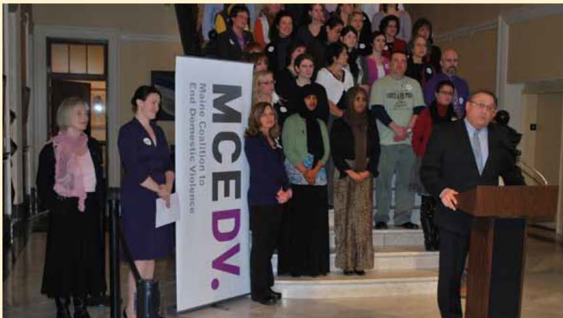
Governor LePage talks about domestic violence policies