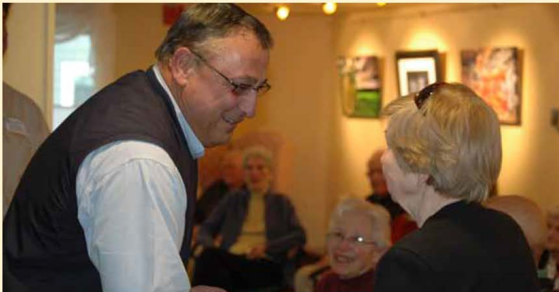
Governor LePage meets with a Highlands Home resident during one of his Capitol for a Day visits

Reformed Maine TURNPIKE AUTHORITY Leadership