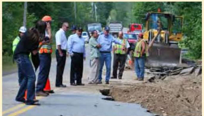
Governor LePage assesses road damage after Hurricane Irene