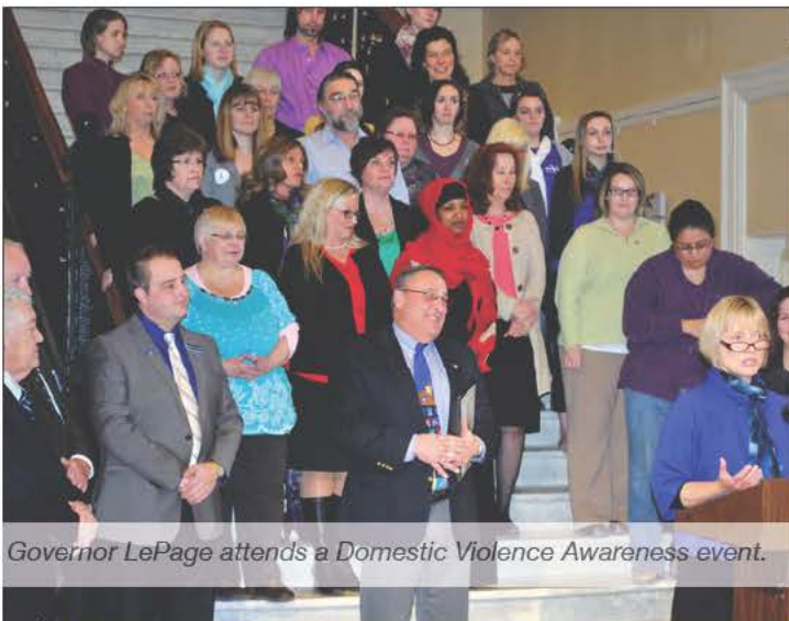
Governor LePage attends a Domestic Violence Awareness event.

Statewide Helpline: 1-866-834-HELP (4357)