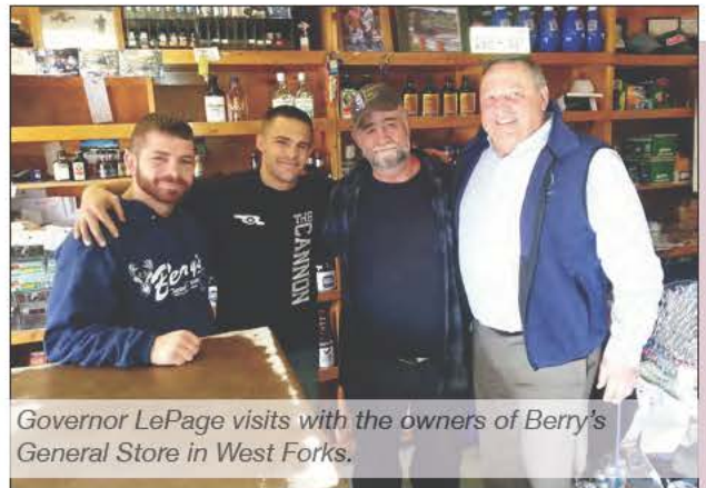
Governor LePage visits with the owners of Berry's General Store in West Forks.