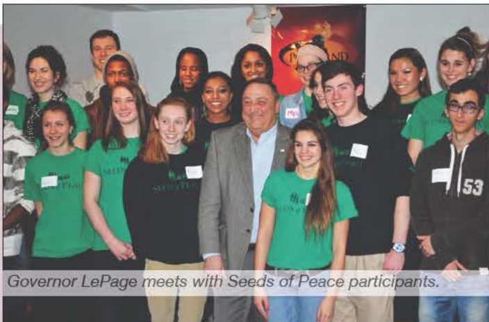
Governor LePage meets with Seeds of Peace participants.