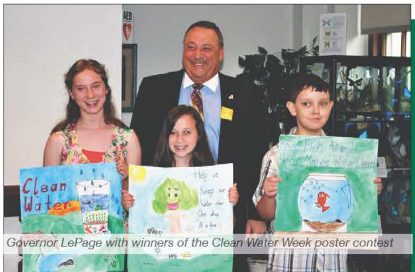
Governor LePage with winners of the Clean Water Week poster contest