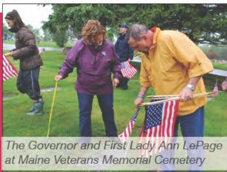
The Governor and First Lady Ann LePage at Maine Veterans Memorial Cemetery