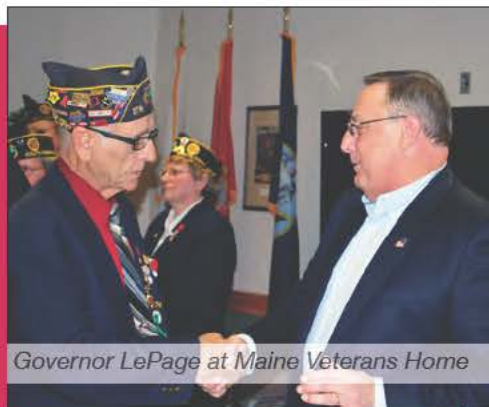
Governor LePage at Maine Veterans Home

"We have the second-largest number of veterans per capita in the nation. We owe our heartfelt gratitude to our troops who defend our freedom and who sacrifice time with their family, friends and communities to serve."