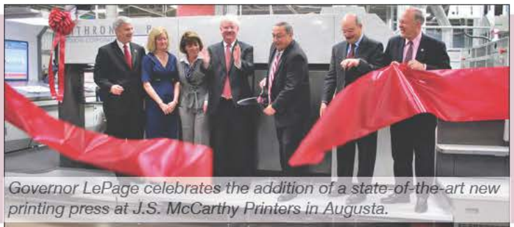
Governor LePage celebrates the addition of a state-of-the-art new printing press at J.S. McCarthy Printers in Augusta.

"Job creators know that my administration wants to help, and my door is always open. You want to create a job; I want to be there to help."