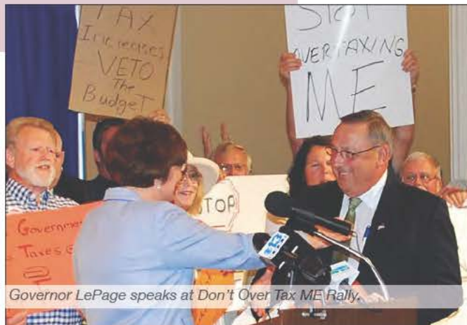
Governor LePage speaks at Don't Over Tax ME Rally.