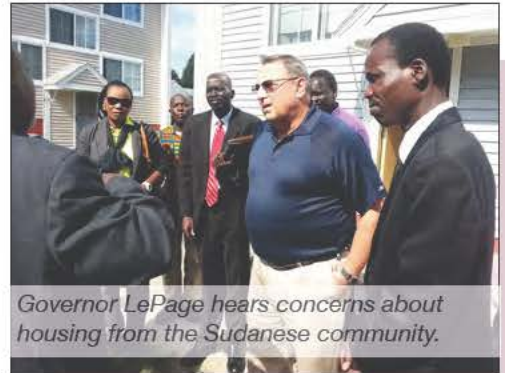
Governor LePage hears concerns about housing from the Sudanese community.

DEFEATED attempts to WEAKEN the SECOND AMENDMENT which would have penalized LAW-ABIDING CITIZENS