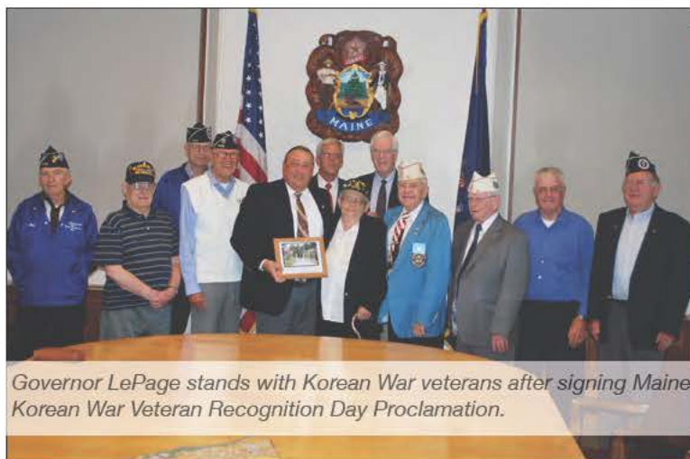
Governor LePage stands with Korean War veterans after signing Maine Korean War Veteran Recognition Day Proclamation.