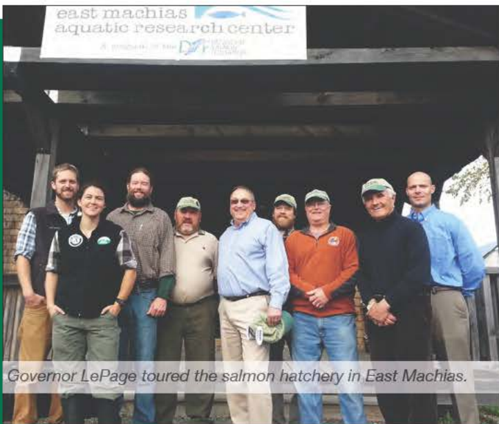
Governor LePage toured the salmon hatchery in East Machias.