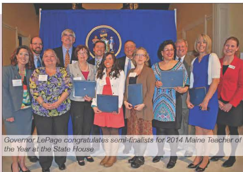
Governor LePage congratulates semi-finalists for 2014 Maine Teacher of the Year at the State House

"I am passionate about education. This passion is not an attack on public schools. I speak passionately because education is what saved my life, and I cannot accept any child not being given the same opportunity I had."