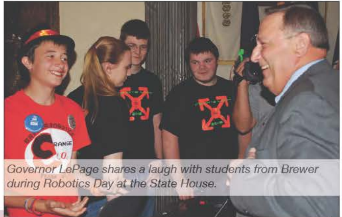
Governor LePage shares a laugh with students from Brewer during Robotics Day at the State House.