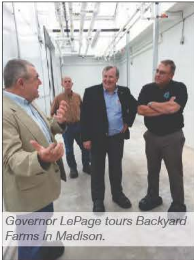
Governor LePage tours Backyard Farms in Madison.