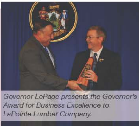
Governor LePage presents the Governor’s Award for Business Excellence to LaPointe Lumber Company.