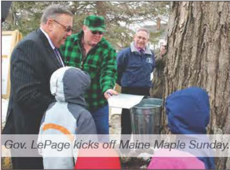
Gov. LePage kicks off Maine Maple Sunday.