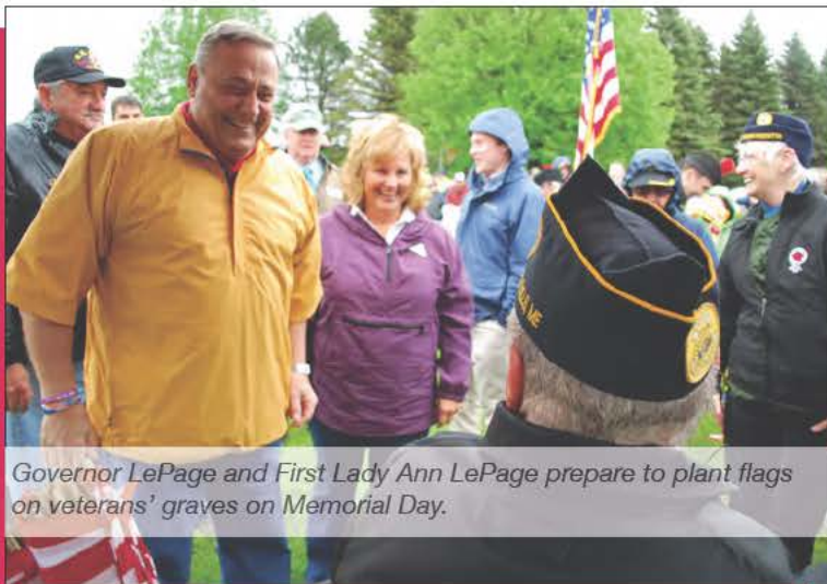
Governor LePage and First Lady Ann LePage prepare to plant flags on veterans' graves on Memorial Day.