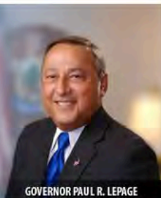
GOVERNOR PAUL R. LEPAGE