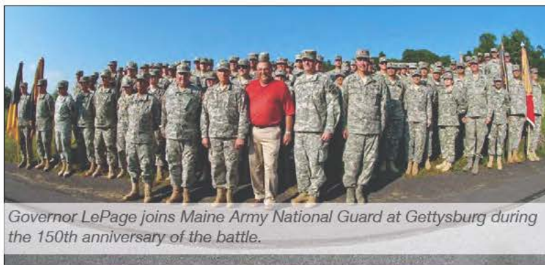
Governor LePage joins Maine Army National Guard at Gettysburg during the 150th anniversary of the battle.