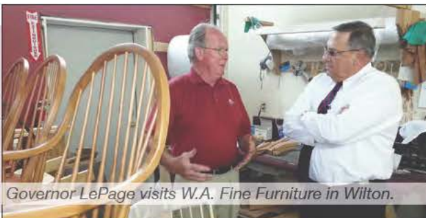
Governor LePage visits W.A. Fine Furniture in Wilton.

“Microenterprises start small, but can grow into large businesses. We must support these growing businesses because they are a critical driver of our economy.”