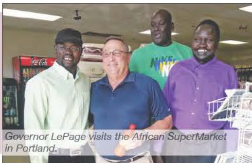
Governor LePage visits the African SuperMarket in Portland.

"It is critical that government at all levels work with job creators—not against them."