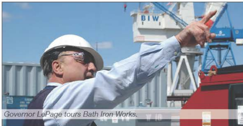
Governor LePage tours Bath Iron Works.

GOVERNOR LEADS TRADE MISSION TO China $2.5 MILLION OF EXPORT SALES PROJECTED IN NEXT 12 months