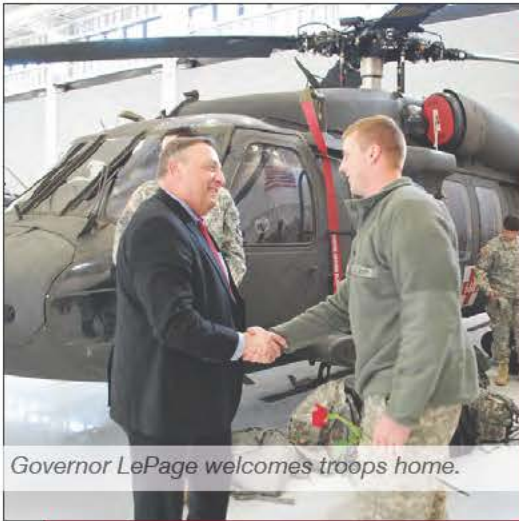
Governor LePage welcomes troops home.