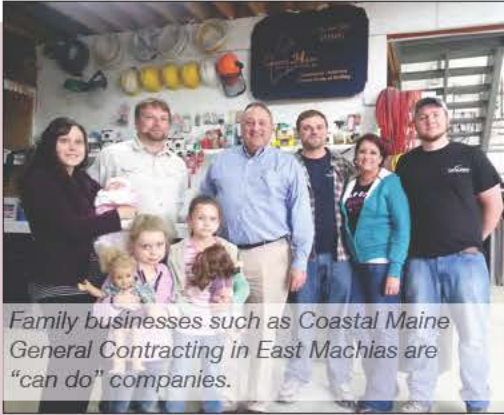
Family businesses such as Coastal Maine General Contracting in East Machias are “can do” companies.