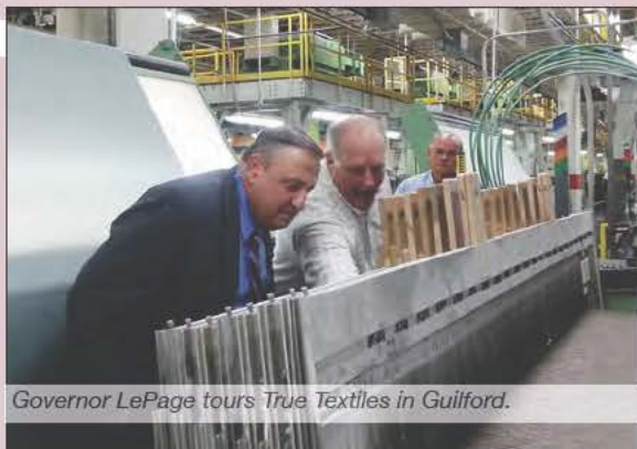
Governor LePage tours True Textiles in Guilford.

This isn't just about this year's budget, or even the next budget cycle. This is about the next generation."