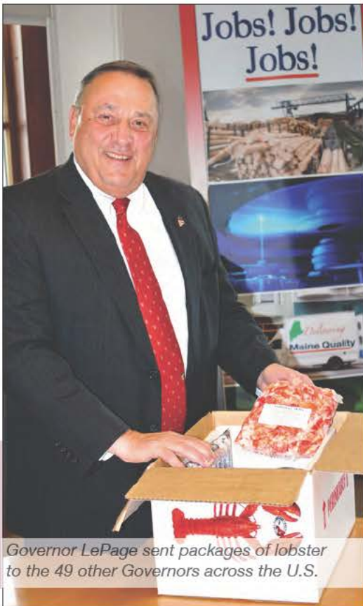
Governor LePage sent packages of lobster to the 49 other Governors across the U.S.