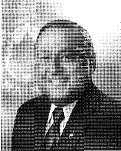
Paul R. LePage Governor of Maine

Compiled and edited by the Department of Administrative and Financial Services, Bureau of the Budget