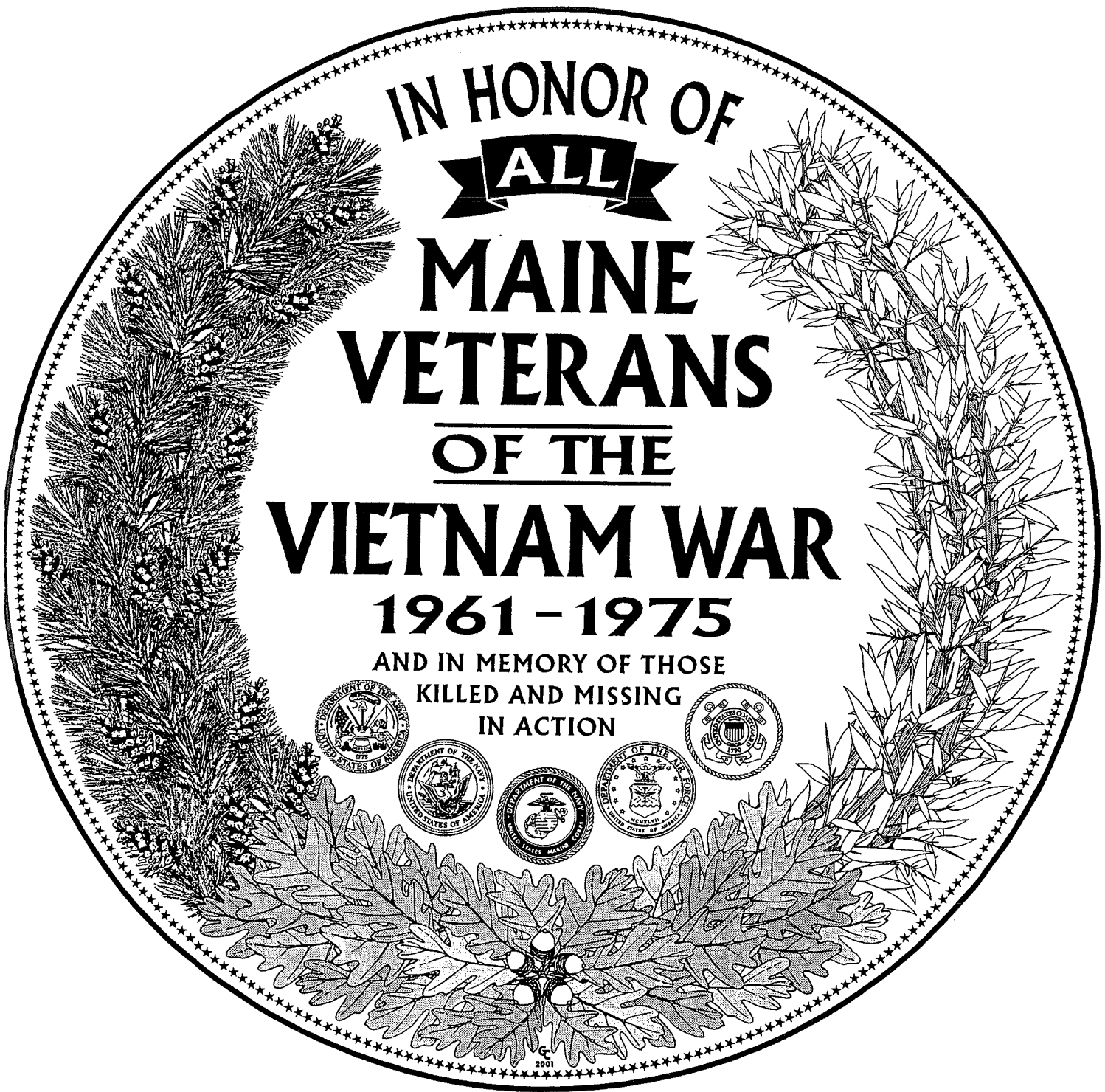
"Vietnam Veterans of Maine Memorial Bronze Plaque" PRELIMINARY LINE ILLUSTRATION