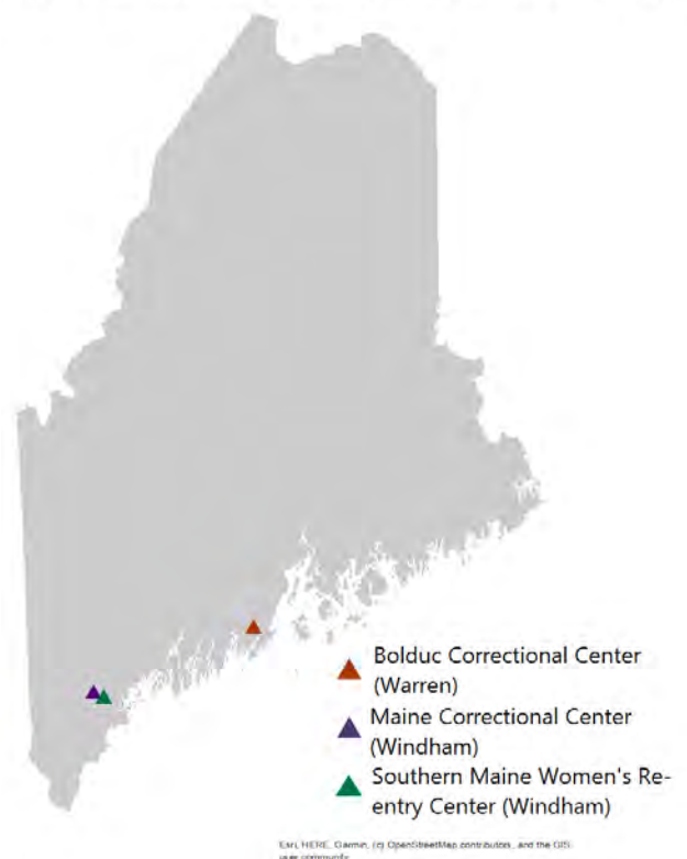
Figure 2. Medication Assisted Treatment Pilot Sites

In February of 2019, in response to the high rates of opioid-related morbidity and mortality in Maine, Governor Mills signed an Executive Order to implement an immediate response to Maine's opioid epidemic. Given that a substantial portion of the opioid-related deaths in Maine are among individuals who are former DOC clients, the Executive Order mandated that multiple sectors, including the criminal justice system, identify ways to expand access to MAT and recovery supports. While MAT has traditionally not been standard practice in correctional settings, medical providers, the courts, and criminal justice agencies have an increased level of awareness that MAT is a medically necessary treatment. In response to government mandates and in-line with the DOC's belief that addiction is a chronic disease requiring medically necessary treatment, DOC began a comprehensive planning process to roll-out MAT in facilities across Maine. The pilot initiative was designed to help incarcerated Mainers access MAT services during and after incarceration.