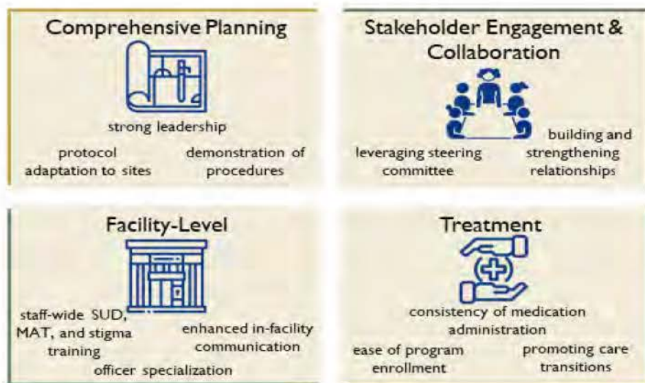
Figure 4. Successful Strategies for Integrating MAT in Correctional Settings

Below is a more detailed description of the strategies used by the Maine DOC to facilitate the successful implementation of MAT services at institutions participating in the MAT pilot program.