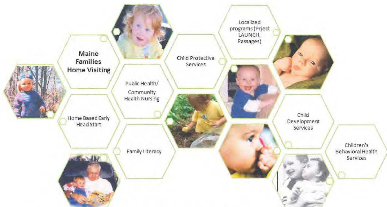
Figure 1. Home Visiting and Home Based Services in Maine