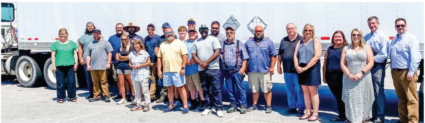
A commercial driver's license (CDL) training course at Eastern Maine Community College funded by the Jobs Plan.

To date, the Jobs Plan has enabled Maine's community colleges to enroll 1,000+ students into free and low-cost training programs, with 206 courses planned or underway.