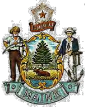
JANET T. MILLS GOVERNOR