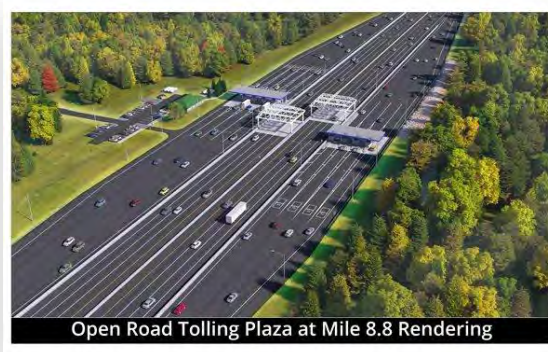
Open Road Tolling Plaza at Mile 8.8 Rendering

In 2016, the Maine Turnpike Authority applied for permits to build a new toll plaza in York at mile 8.8. The US Army Corps of Engineers and the Maine Department of Environmental Protection require applications. It is anticipated that the permits will be received in 2017. The MTA's consultant, Jacobs Engineering researched and produced three reports regarding the relocation of the York Toll Plaza pertaining to Air, Noise and Highway Lighting.