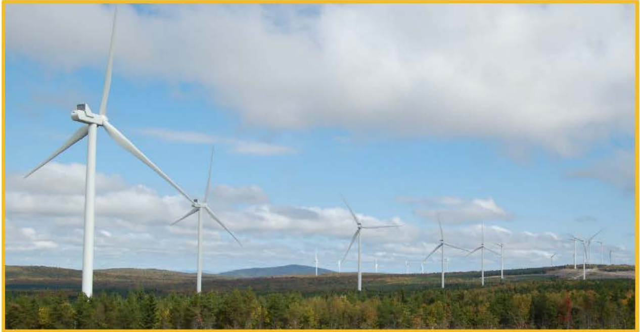
Bingham Wind Project, Novatus Energy.

Maine Trust Board of Directors. GEO also worked very closely with multiple state agencies and departments, including the Governor's Office of Policy Innovation and the Future.