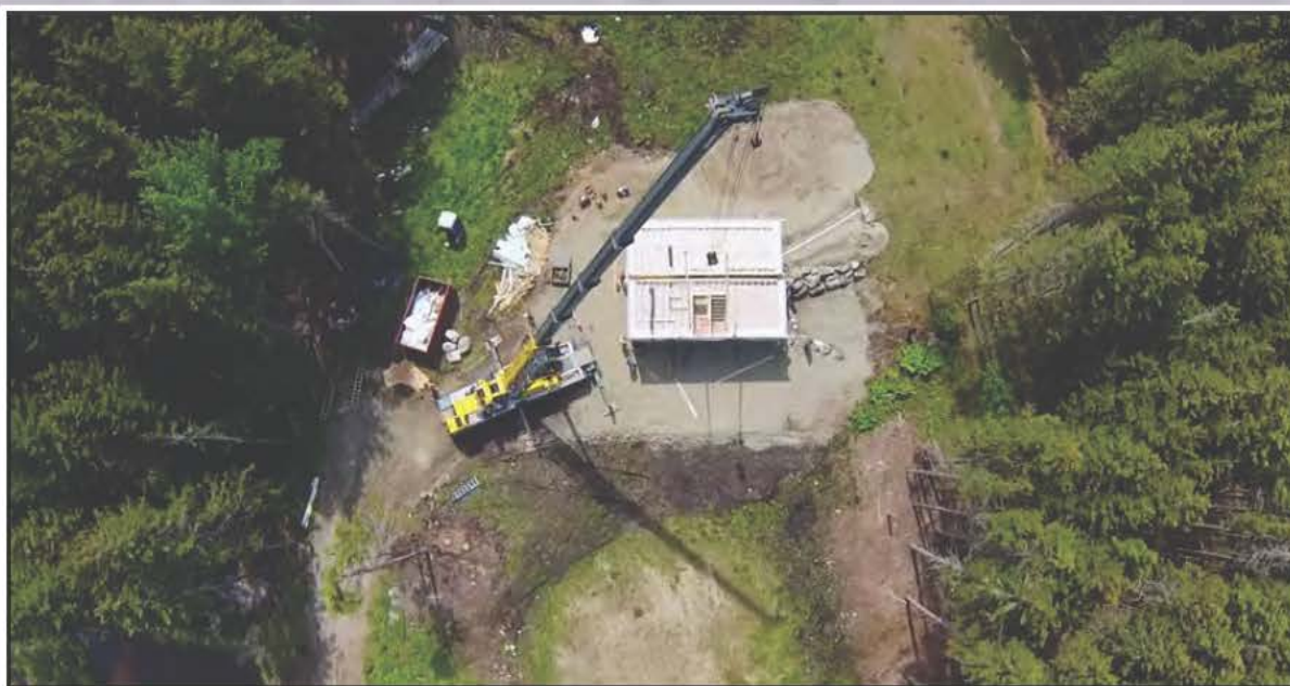
(Top) A section of one of the modular homes leaves Mount Desert Island for Great Cranberry Island. There, (above) a crane lifts and positions the section in place.

The Island Initiative was a huge helping hand to forward the cause, complementing ongoing efforts by islands to develop affordable housing on their own through private fundraising efforts, in recognition of the importance of preserving their communities and schools. They continue to seek ways to attract year-long residents to join them.