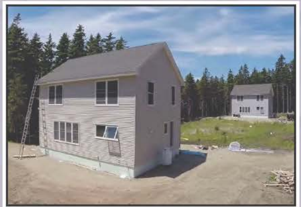
Two Maine Island Housing Initiative houses.

In 2010, MaineHousing granted a one-time award of $2 million to year-round island communities to help build affordable rental units. In June 2014, the last of the affordable housing projects on seven Maine islands was completed. The site was Great Cranberry Island, a community located more than 40 minutes by boat off the coast of Mount Desert Island.