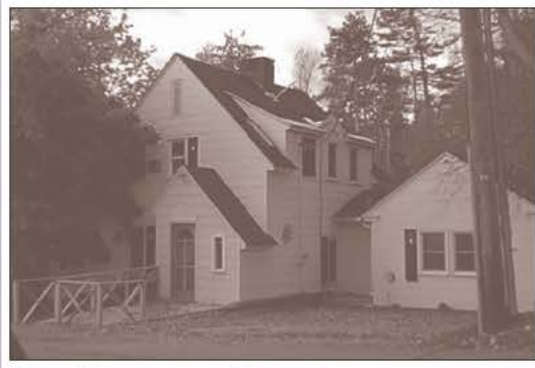
MaineHousing in 1969