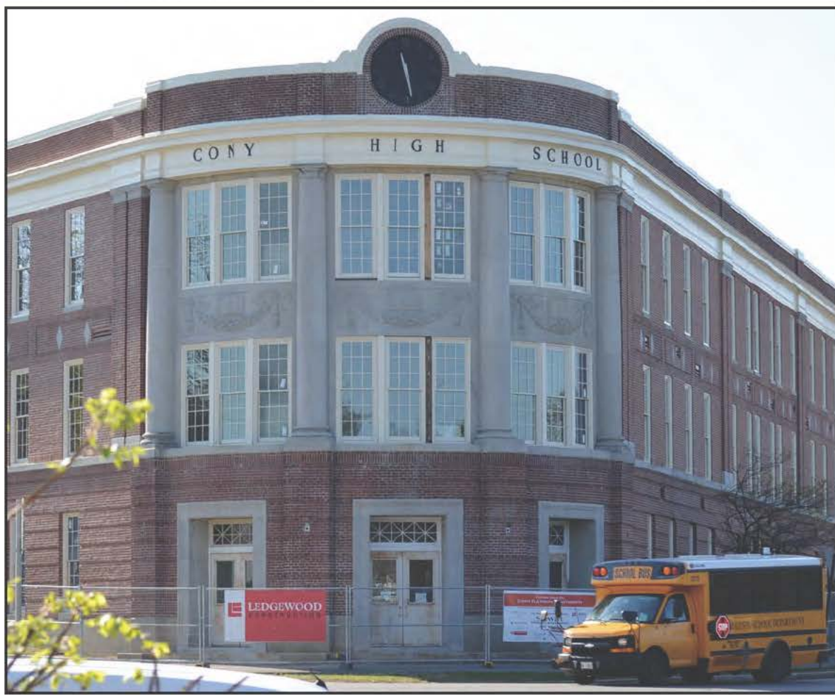
The former Cony High School in Augusta will open in fall 2015 as affordable senior housing.