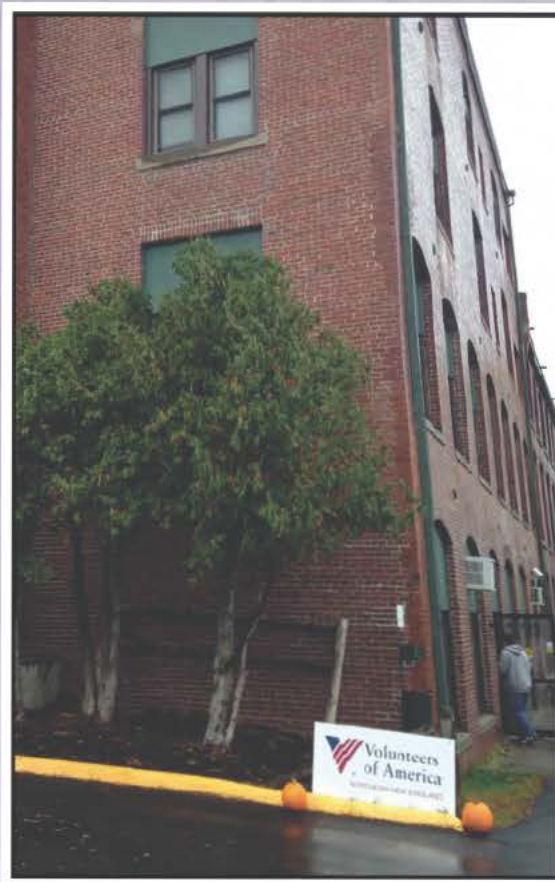
Penobscot Terrace in Old Town was rehabilitated in 2014 to continue providing affordable housing.

Since its inception in 1969, MaineHousing has financed an estimated 1,000 multifamily housing projects that were new construction as well as acquisition and rehabilitation properties. MaineHousing's current portfolio consists of 788 multifamily housing projects containing 20,853 elderly and family residential units.