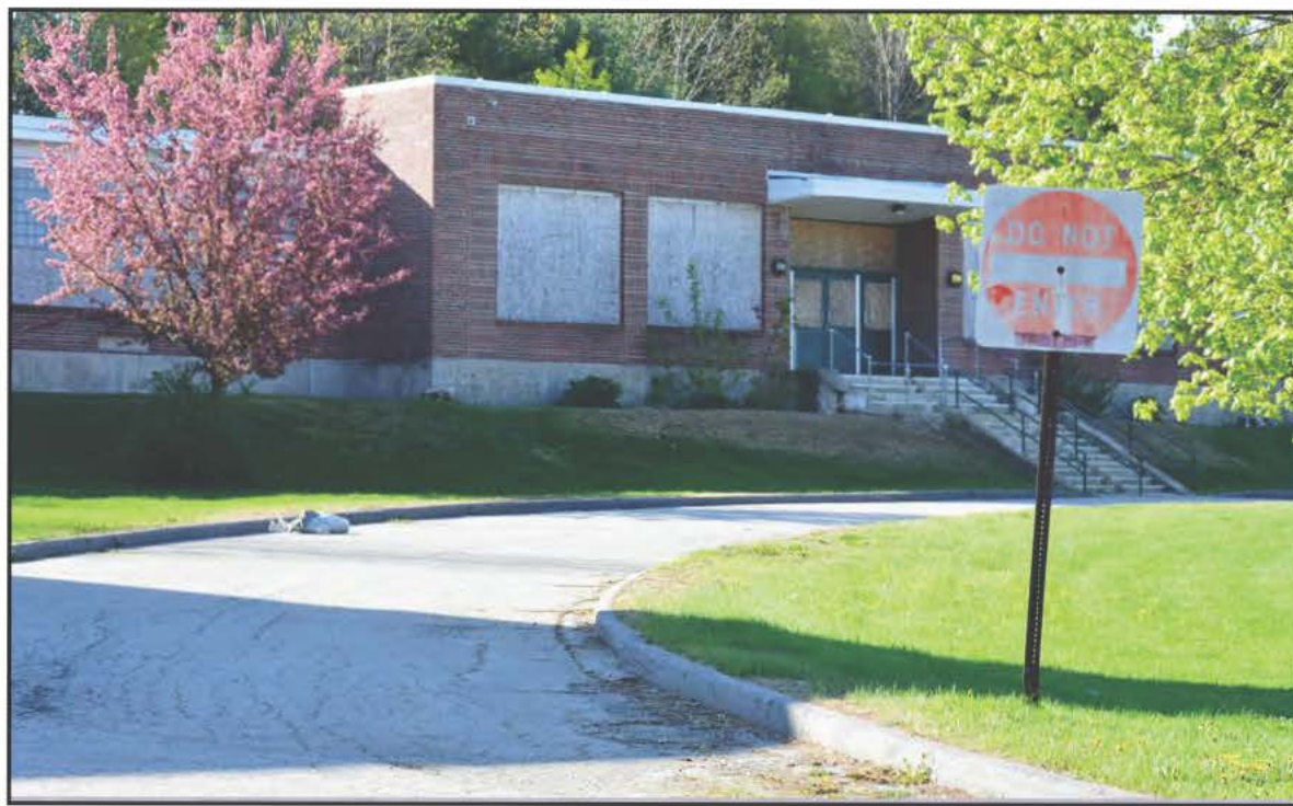
The shuttered Hodgkins School in Augusta soon will become affordable senior housing after being awarded Low Income Housing Tax Credits in the 2014 Qualified Allocation Plan.

an additional $11.7 million in local income, $2.2 million in taxes and other revenue for local governments, and create 61 local jobs.