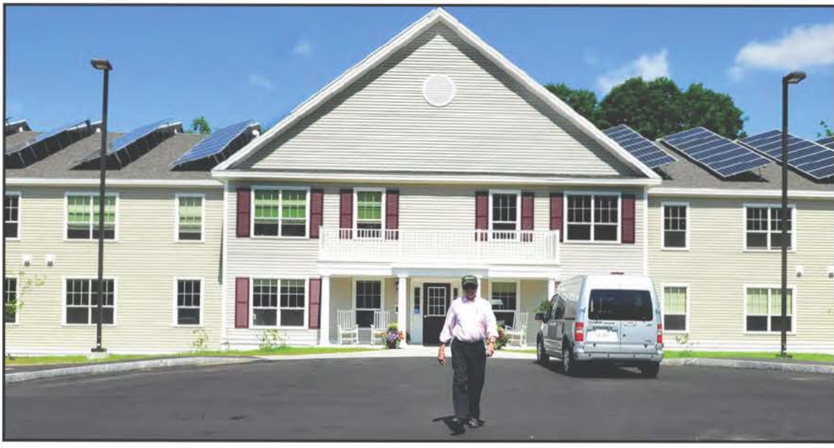
Solar panels (above) are a fixture on the Brookside Village Apartments in Farmington, Maine.