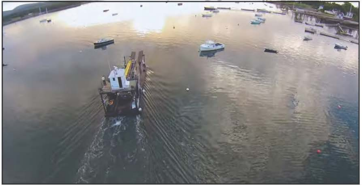
A barge carrying a crane leaves Mount Desert Island for an affordable housing project on Great Cranberry Island.