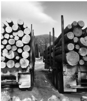
Timber Taken from Day's Academy Grant

Bureau staff closely supervise each harvest by providing loggers with strict harvesting criteria. These criteria specify which trees are to be harvested. In some cases, the Bureau will mark individual trees for removal, such as when there are high value stands, or other high value resources in special management areas having specific Bureau harvest protocols such as riparian areas or deer wintering areas. Also, when working with a new contractor, the Bureau may mark trees in a demonstration area. All harvest operations are inspected by Bureau staff on a weekly basis; more often when individual situations warrant.