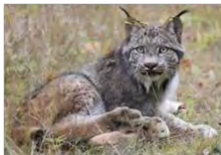
Canada Lynx

Lynx Habitat Management. The Bureau has entered into a Memorandum of Agreement with IF&W to manage a 23,000 acre portion of the Seboomook Unit for the federally threatened Canada lynx. The MOA describes management actions the Bureau will undertake during the 15 year term of the agreement such as timber harvesting activities that will maintain and enhance 6,200 acres of optimum habitat for snowshoe hare, the primary prey of lynx.