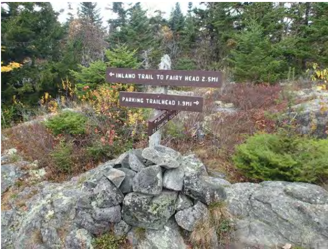
Trail Signs on the Cutler Unit

Cutler Coast. The Maine Conservation Corps, funded through the Recreational Trails Program, continued work rehabilitating trails at the Cutler Coast Trail.