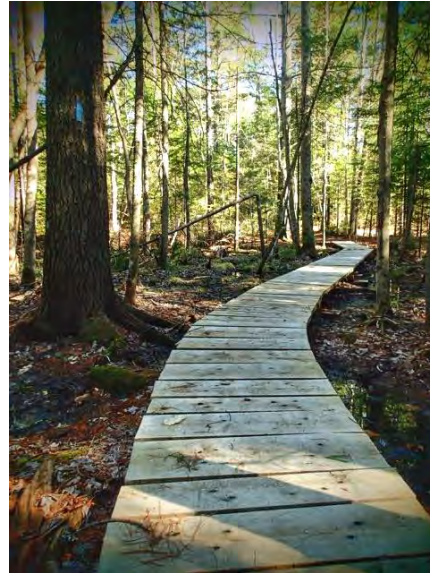
Portion of the South Loop Trail Constructed in the Pineland Public Lands

Pownal and at Pineland Public Lands, with the power corridor trail in between. Work also continued on the Pineland trails.