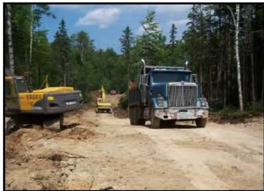
Management Road Construction at Nahmakanta

The Bureau continued to improve road access within its public lands, focusing primarily on recreational needs and implementation of its timber management program. There are currently about 275 miles of public use roads on Public Lands.