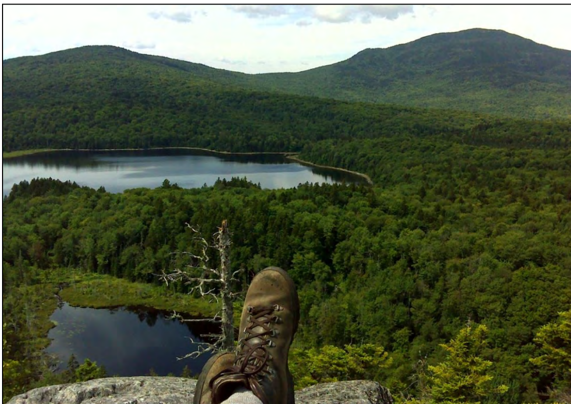
View from Hiking Trail Across Little Moose Unit

MAINE DEPARTMENT OF AGRICULTURE, CONSERVATION AND FORESTRY Bureau of Parks and Lands