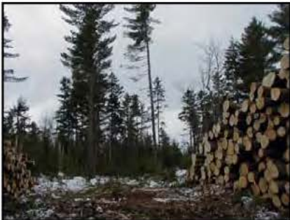
Harvest operation at Richardson Lakes

Bureau staff closely supervises each harvest by marking individual trees for removal or by providing loggers with strict harvesting criteria. These criteria specify which trees are to be harvested. All harvest operations are inspected by Bureau staff on a weekly basis; more often when individual situations warrant.