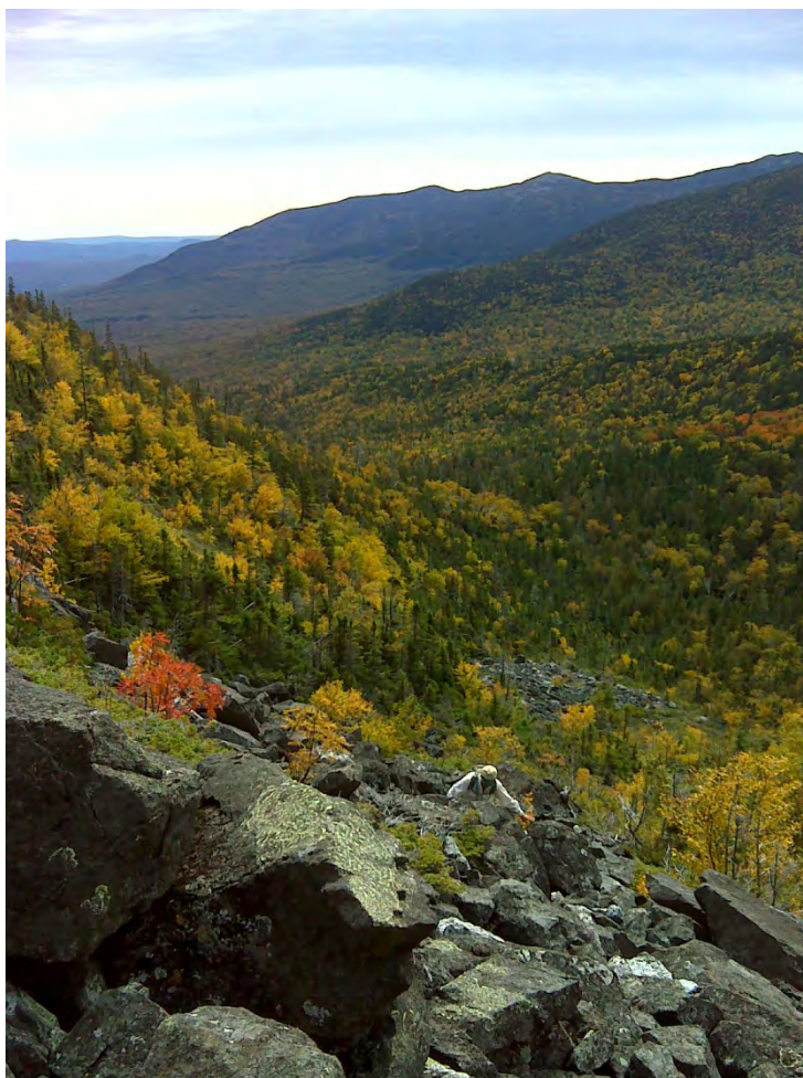
Crocker Mountain Unit

MAINE DEPARTMENT OF AGRICULTURE, CONSERVATION AND FORESTRY Bureau of Parks and Lands