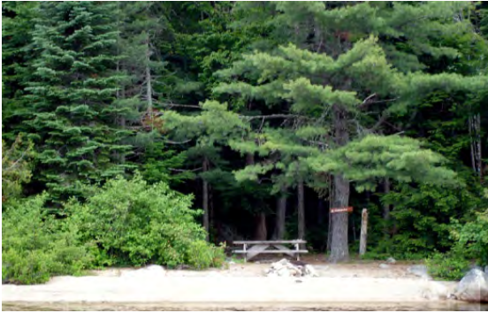
Campsite on Nahmakanta Lake

An additional recreation management project involved a survey of boats stored at remote ponds on the Nahmakanta Unit. Boat owners were notified of upcoming enforcement of the boat storage policy, which has been established to protect the character of remote ponds.