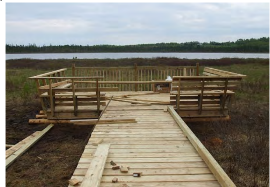
Salmon Brook Lake Bog observation platform during construction

Salmon Brook Lake Bog. MCC and regional staff constructed 1.0 miles of hiking trail, a footbridge, and 100' of boardwalk at Salmon Brook Lake Bog (with Recreational Trails Program funds). A road project funded by the Land for Maine's Future was completed.