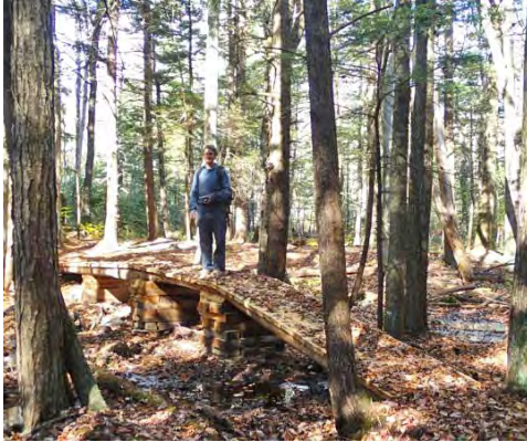
A Mt. Bike-Friendly Bridge Constructed in the Pineland Public Lands

Bigelow Preserve. A 900 hour Maine Conservation Corps Environmental Steward position assisted management efforts and visitor education at the Preserve. Work was completed on the Gravel Pit Campsite near Little Bigelow. The Safford Brook Trail relocation was finished. Existing campsites were renovated and internal pathways between the multiple sites were cleared at Round Barn.