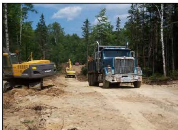
Management Road Construction at Nahmakanta

The Bureau continued to improve road access within its public lands, focusing primarily on recreational needs and implementation of its timber management program. There are currently about 263 miles of public use roads on Public Lands.