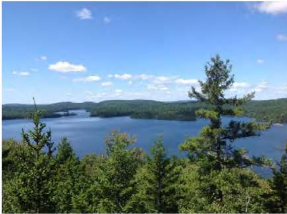
Scraggly Lake from the Owl's Head

The Recreational Trails Program funded Maine Conservation Corps trail crew constructed a 0.7 mile hiking trail from the campsite cluster on Scraggly Lake to the Owls Head Trail. Staff installed hiking trail signage.