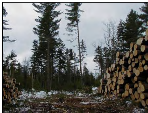
Harvest operation at Richardson Lakes

Division staff closely supervises each harvest by marking individual trees for removal or by providing loggers with strict harvesting criteria. These criteria specify which trees are to be harvested. All harvest operations are inspected by Division staff on a weekly basis; more often when individual situations warrant.