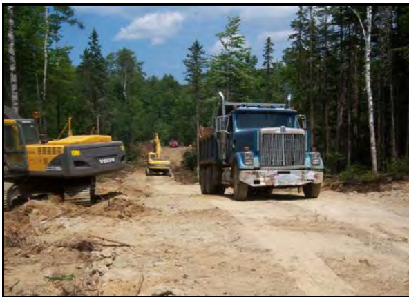
Management Road Construction at Nahmakanta

The Division continued to improve road access within its public lands, focusing primarily on recreational needs and implementation of its timber management program. There are currently about 263 miles of public use roads on Public Lands.