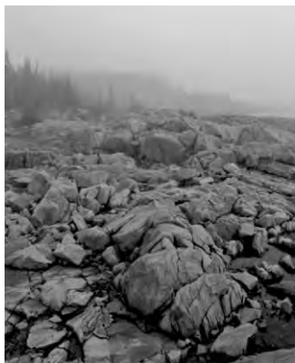
Cutler Coast near Fairy Head

Duck Lake. A new vault toilet was installed at the Gassabias Lake campsites.