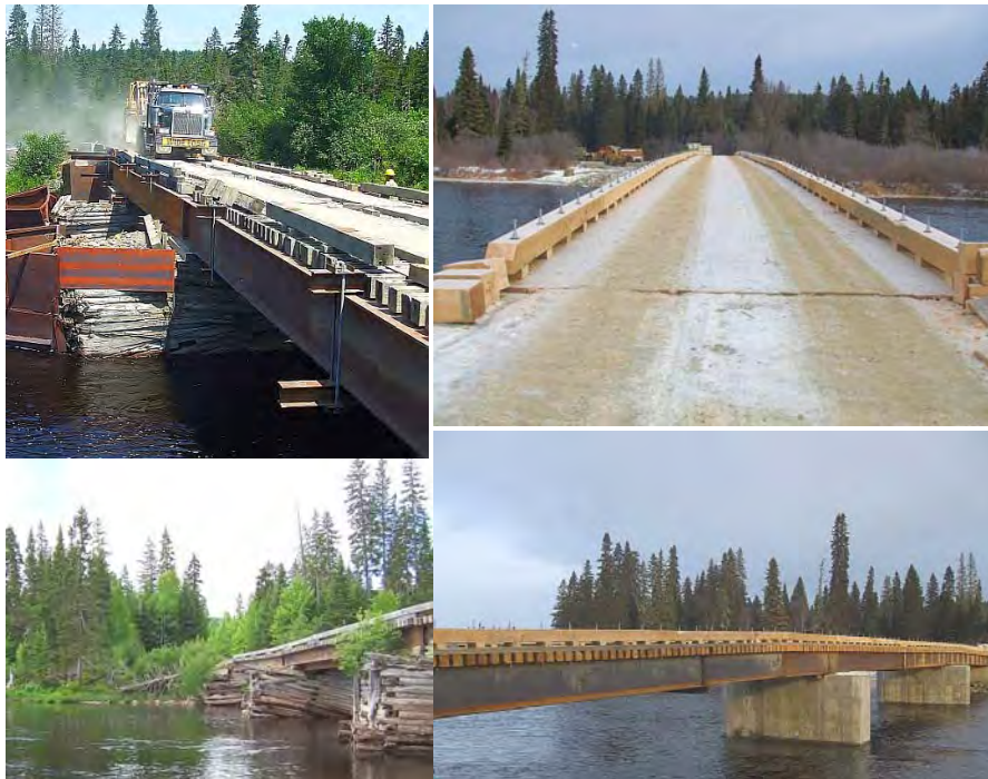
Before and After – Reconstruction of the Henderson Brook Bridge, Allagash Waterway