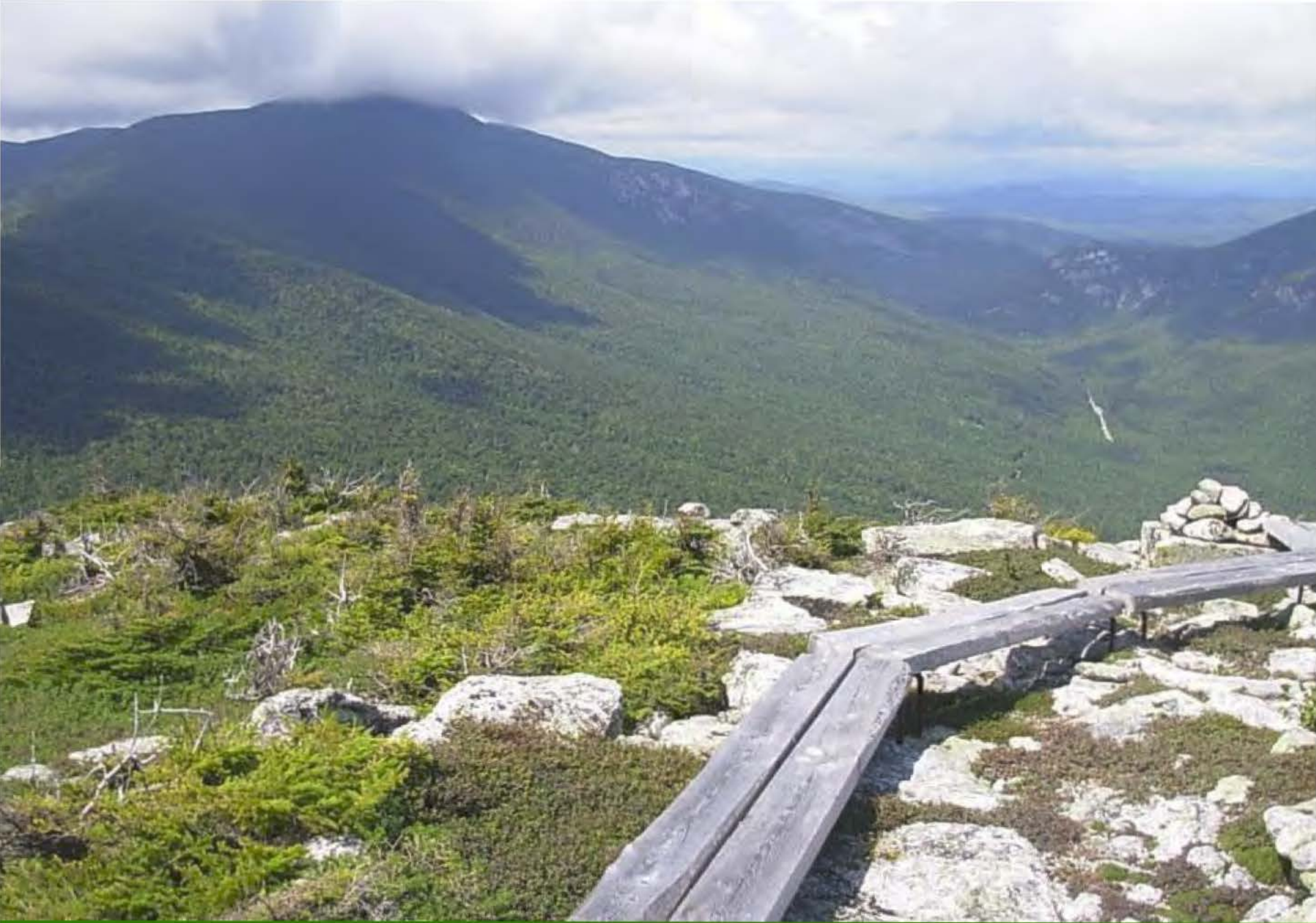
Grafton - Stowe