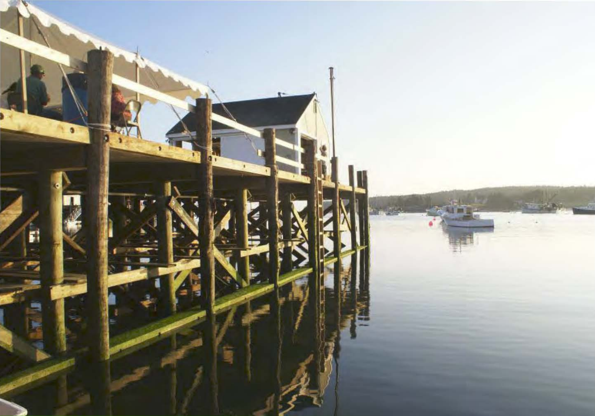
Port Clyde Coop