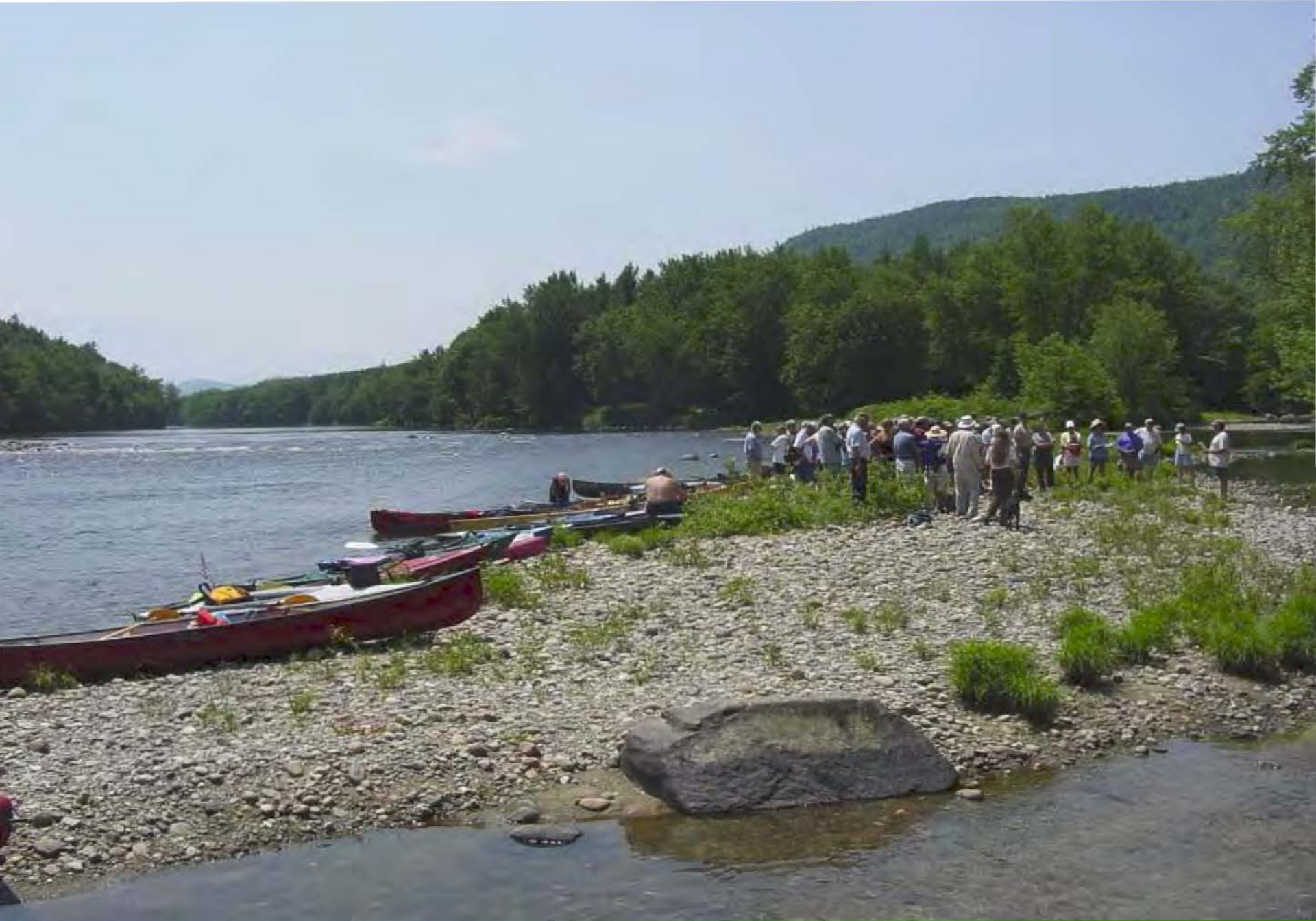
Bear River Rips