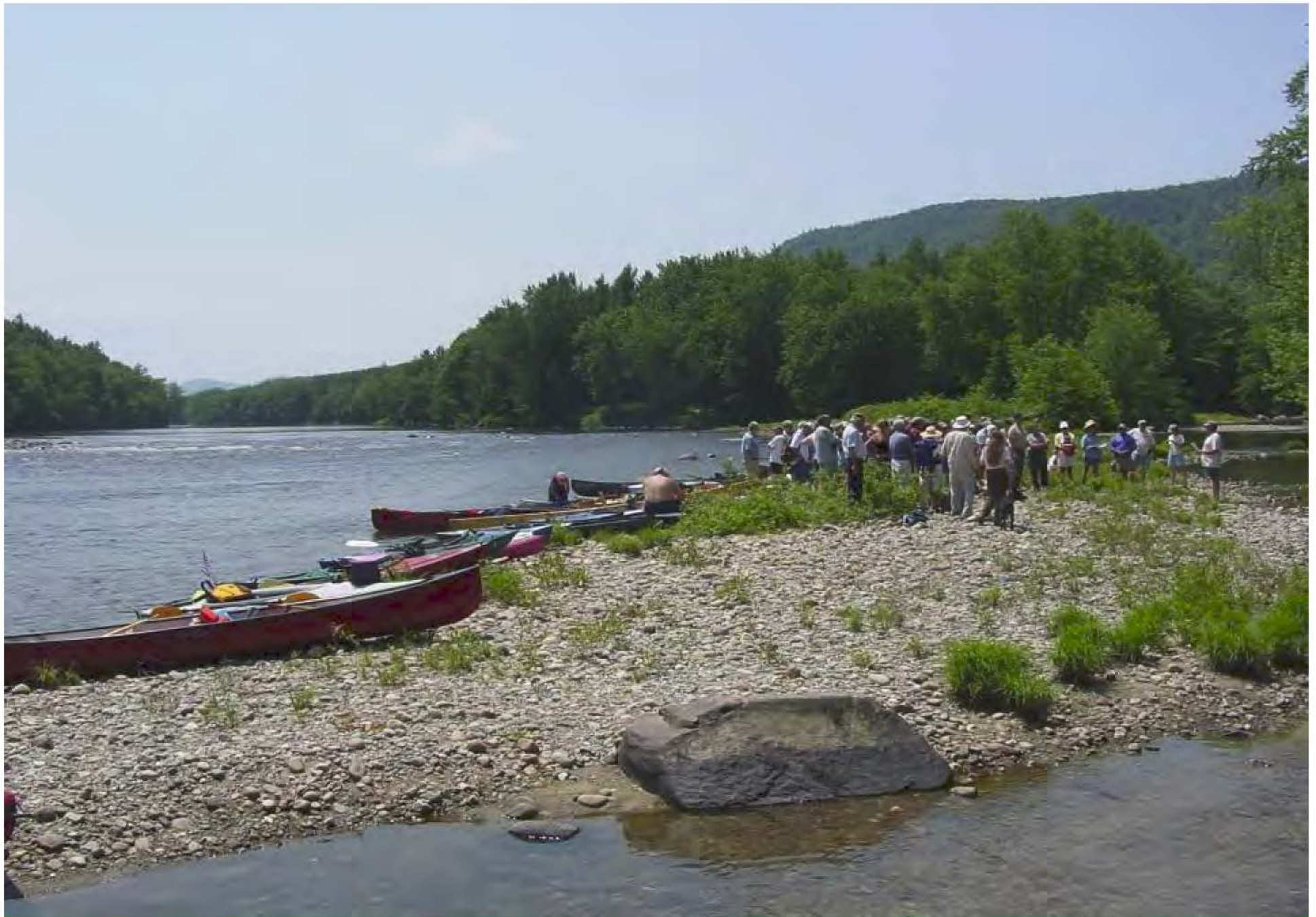
Bear River Rips