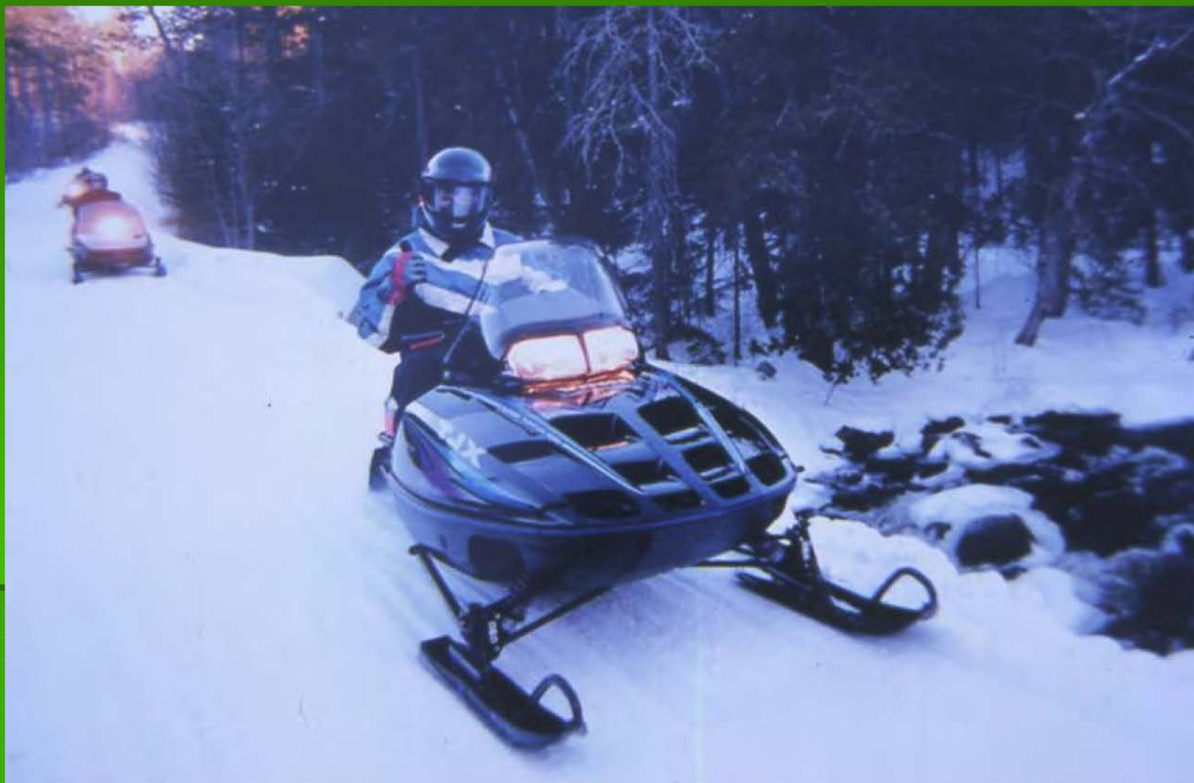
Newport to Dover-Foxcroft Rail Trail