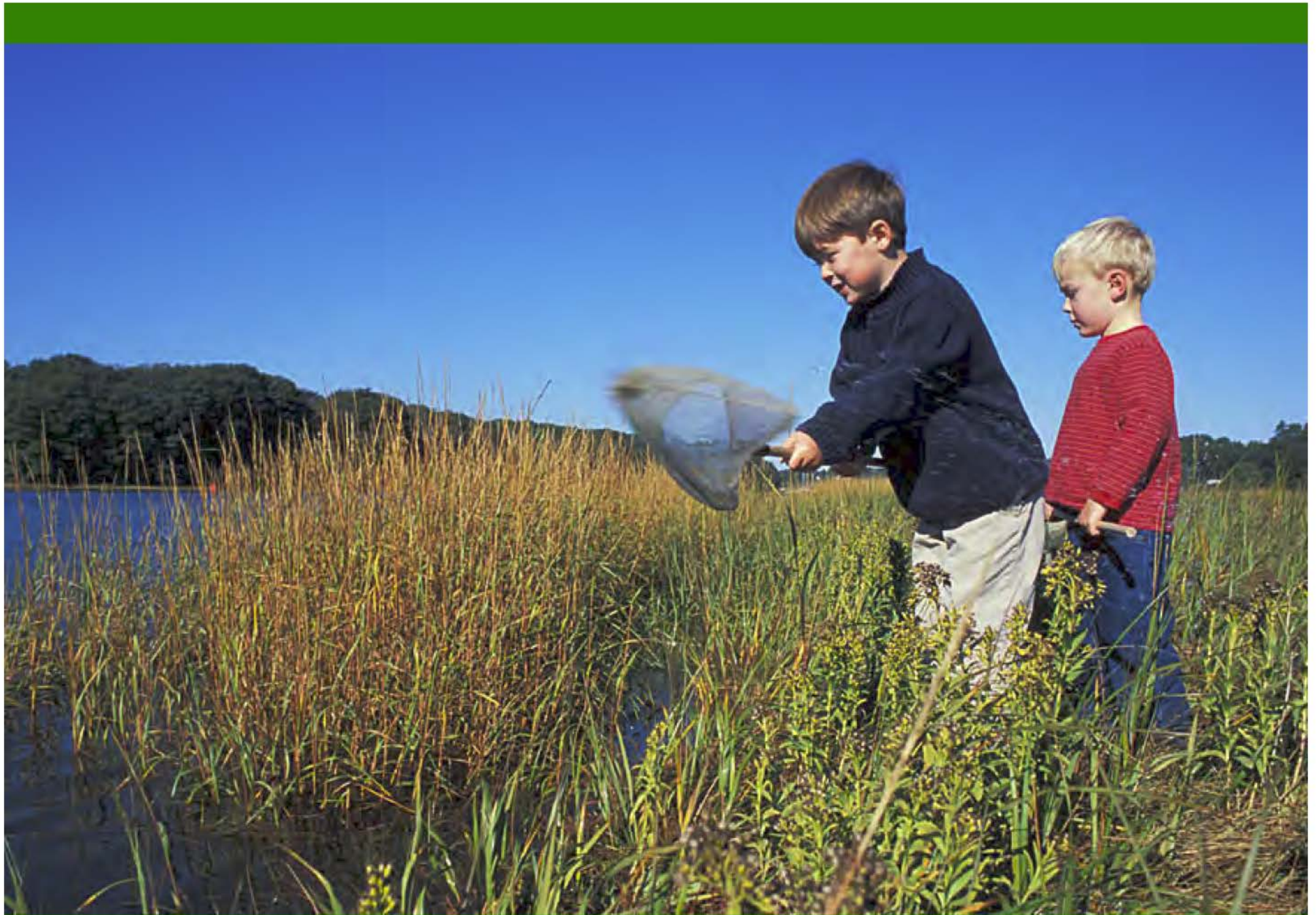
Royal River Preserve