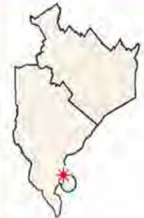
Closest Town Cape Elizabeth

Region Southern Maine - York, Cumberland