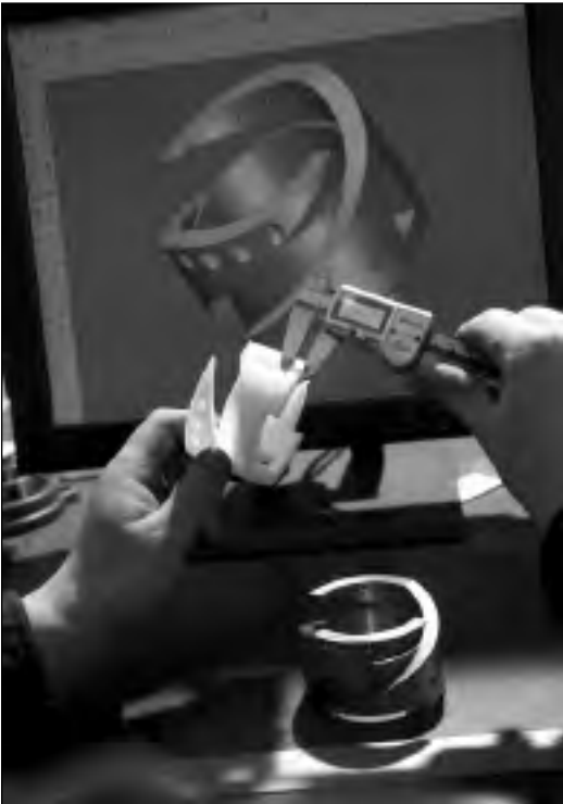
In addition to prototyping, AMC engineers use their "design build" approach to solve manufacturing problems and support research programs in the state.