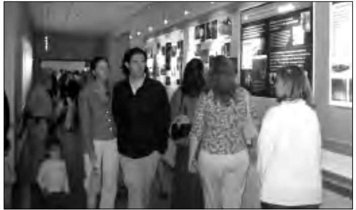
Visitors to the new USM Aquatic Systems Offices at the Gulf of Maine Aquarium in Portland.

postdoctoral student joined the staff of the Maine Center for Toxicology and Environmental Health (MCTEH). As part of its biosciences initiative, USM also added support for one doctoral student, bringing the number of Ph.D. students at USM from five to six.