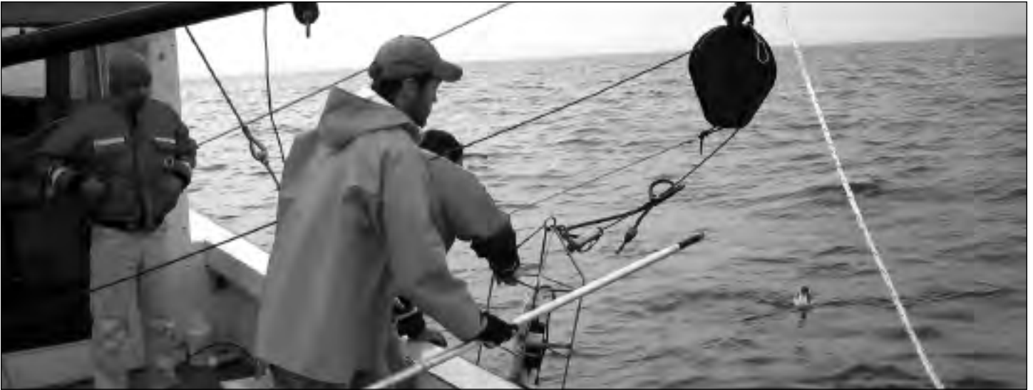
Undergraduate student participation in research is on the rise at USM. "Thinking Matters," a two day celebration of student achievement, showcased more than 170 presentations of original research and student faculty collaborations.