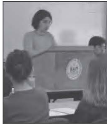
Undergraduate student participation in research is on the rise at USM. "Thinking Matters," a two day celebration of student achievement, showcased more than 170 presentations of original research and student faculty collaborations.