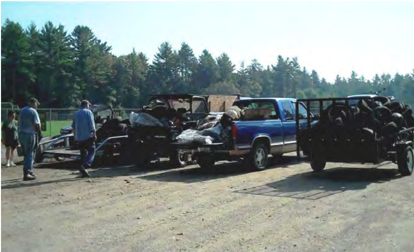
Waterford Crew and Pickup Trucks