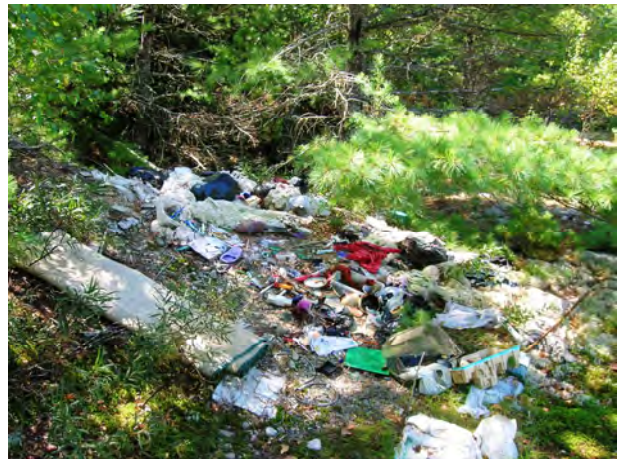
Limington – Cleanup, Before (above), After (below)