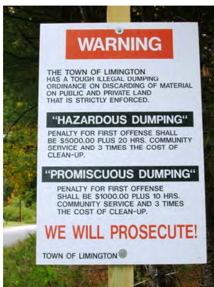
New Signs Posted by the Town of Limington after the Cleanup Event