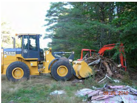
Limington Crews at Work during the Cleanup