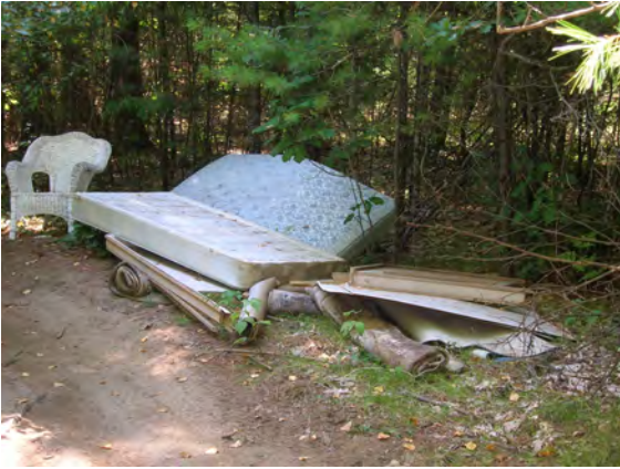
Limington – Before Cleanup