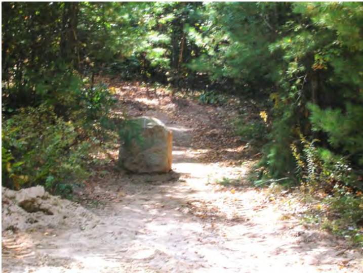
Dirt Road Blocked to Prevent Dumping by Trucks