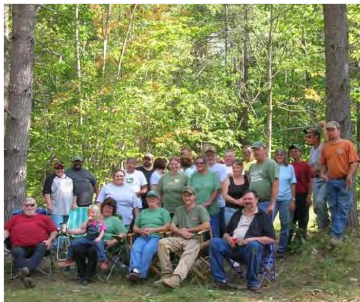
Limington Wheelers ATV Club Cleanup Crew