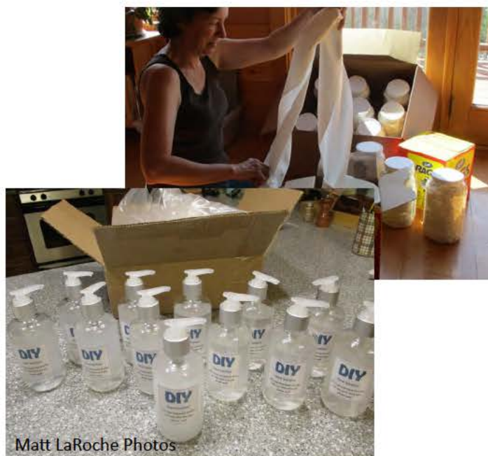
Matt LaRoche Photos