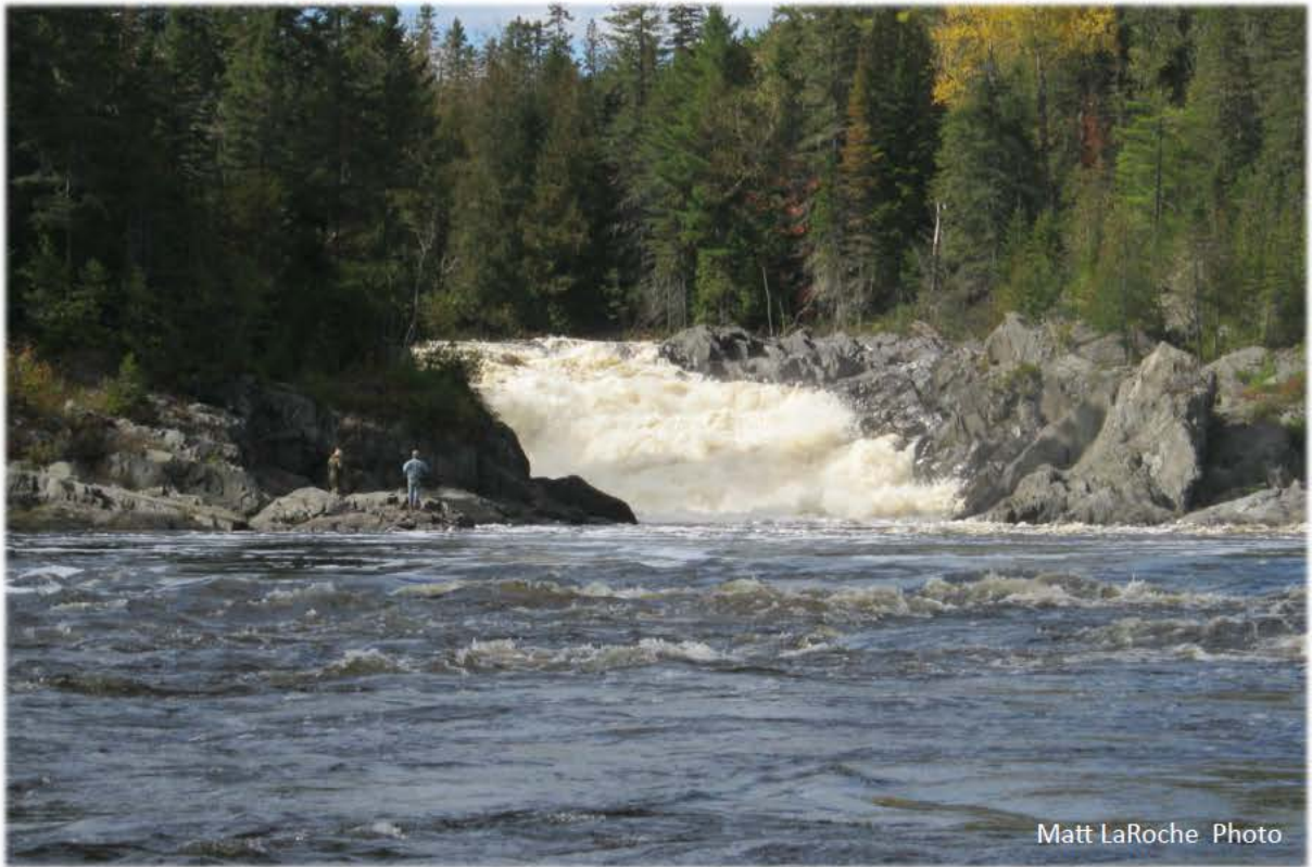
Matt LaRoche Photo