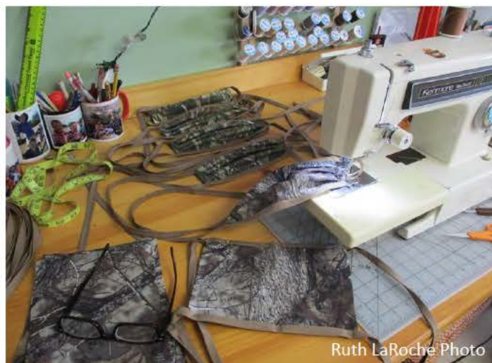
Ruth LaRoche Photo