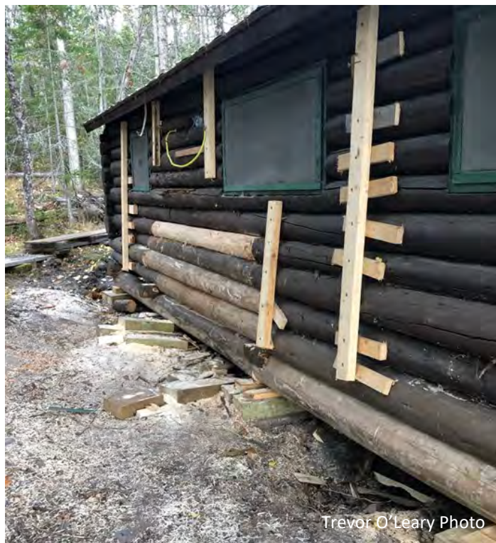
Trevor O'Leary Photo