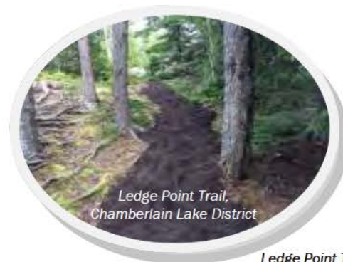
Ledge Point Trail, Chamberlain Lake District