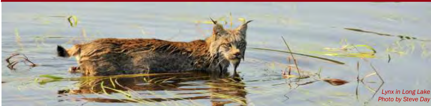
Lynx in Long Lake