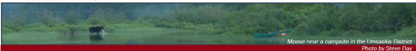
Moose near a campsite in the Umsaskis District

Whereas the preservation, protection and development of the natural scenic beauty and the unique character of our waterways, wildlife habitats and wilderness recreation resources for this generation and all succeeding generations; the prevention of erosion, droughts, freshets and the filling up of waters; and the promotion of peace, health, morals and general welfare of the public are the concern of the people of this State, the Legislature declares it to be in the public interest, for the public benefit and for the good order of the people of this State to establish an area known as the Allagash Wilderness Waterway.