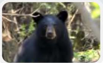
Black Bear; Photo by Steve Day

Note: The AWW is required by Statute, Title 12 section 1882.3, to maintain 19 snowmobile access points to the watercourse.