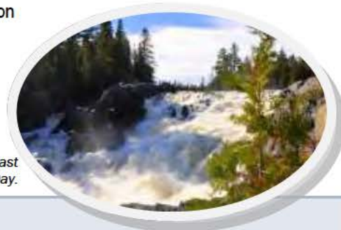
Allagash Falls, East