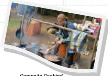
Campsite Cooking