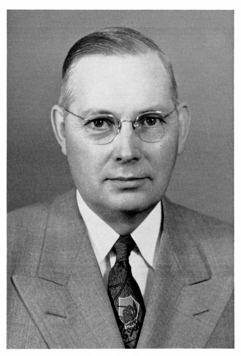
BURTON M. CROSS GOVERNOR OF MAINE