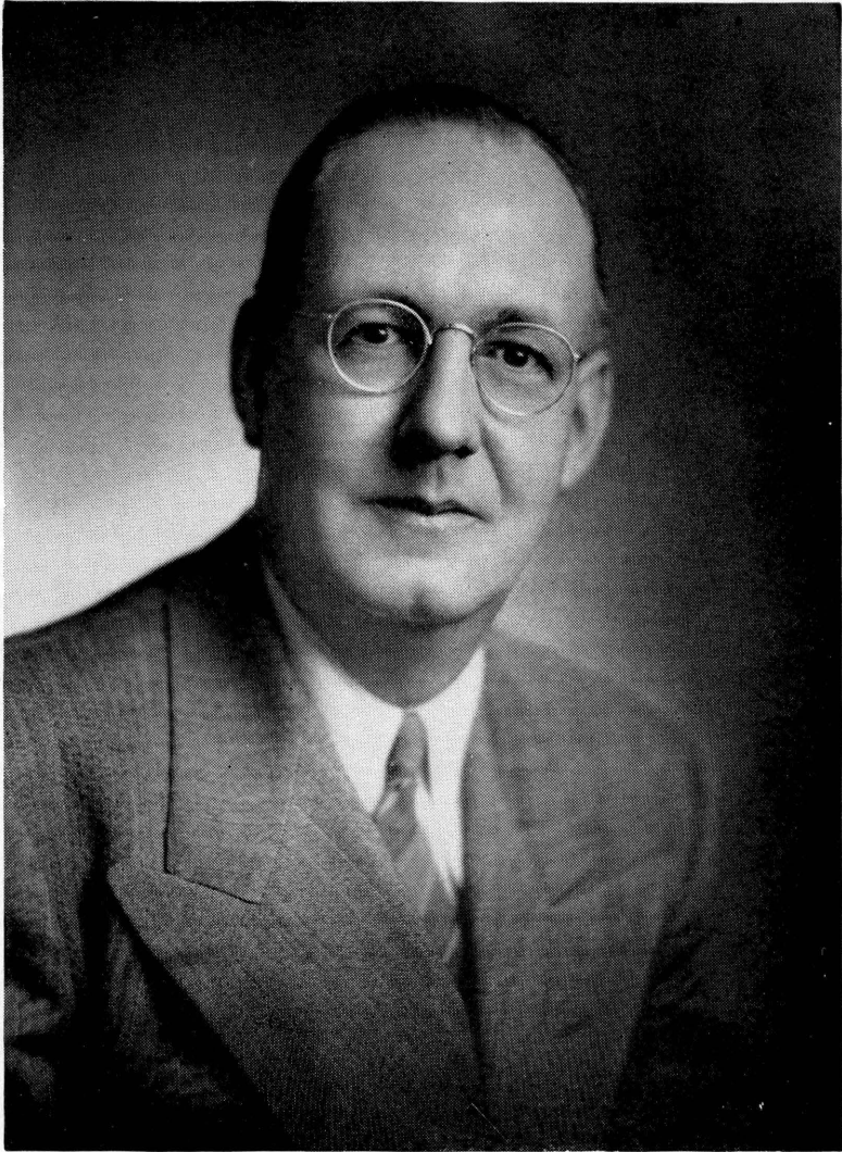
FREDERICK G. PAYNE