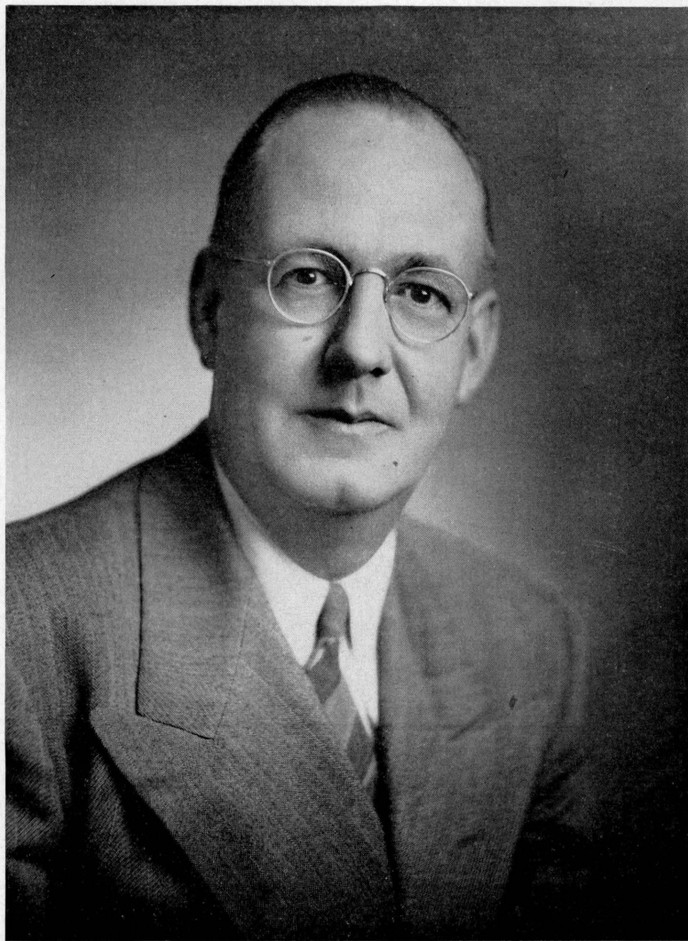
FREDERICK G. PAYNE GOVERNOR OF MAINE