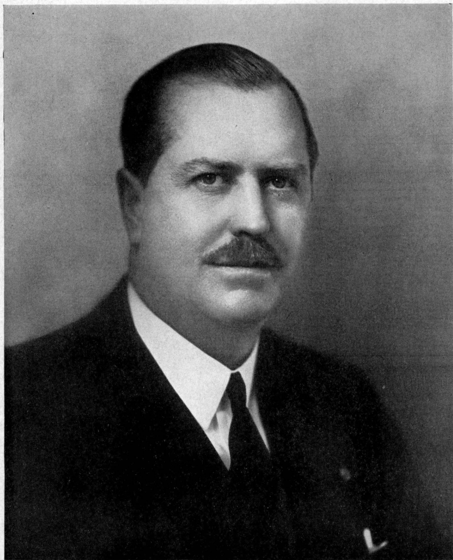
SUMNER SEWALL GOVERNOR OF MAINE