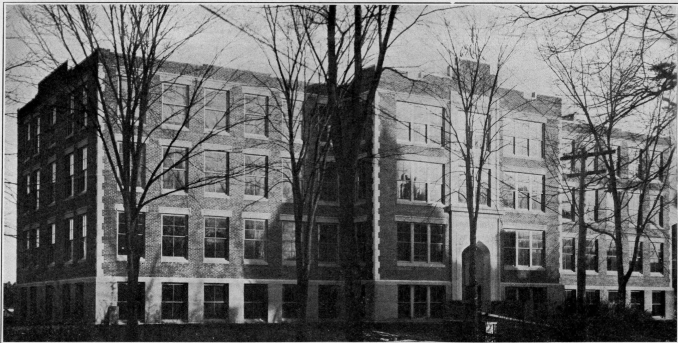
"Aubert Hall," University of Maine; New Quarters for Dept. of Chemistry.