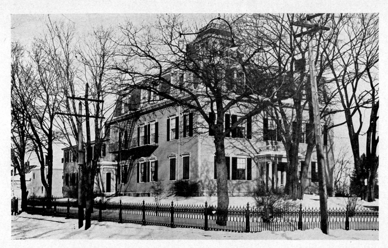
Bath Military and Naval Orphan Asylum