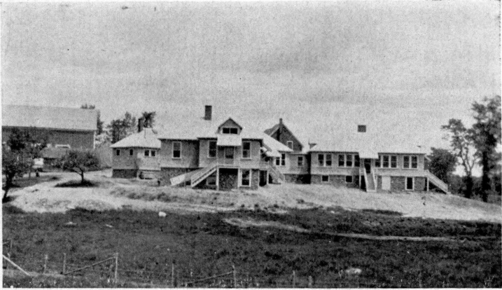
Valley Farm Group