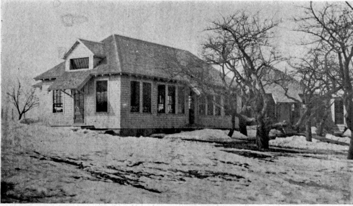
One of the Hill Farm Dormitories