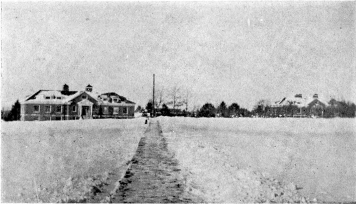
The Two Girls' Buildings