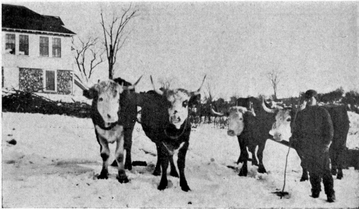
Some of the Willing Helpers