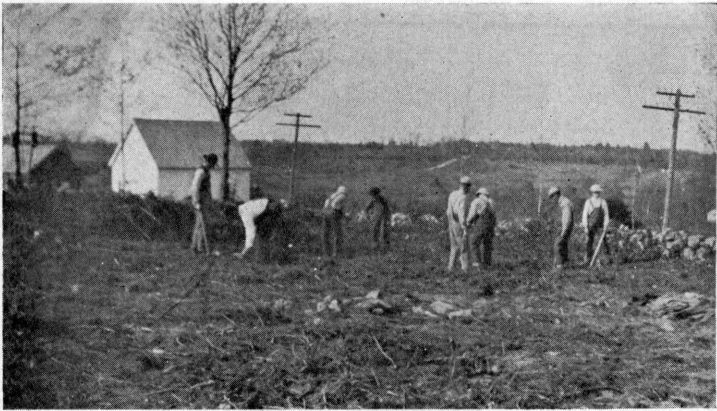
Boys at Work