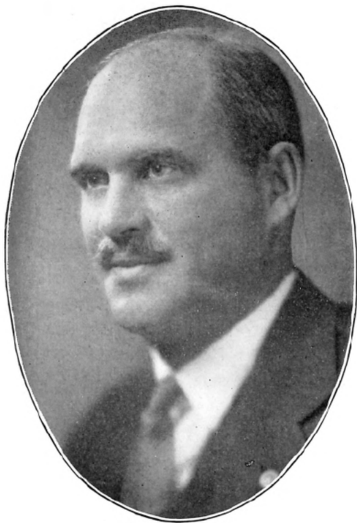
The Governor WILLIAM TUDOR GARDINER of Gardiner