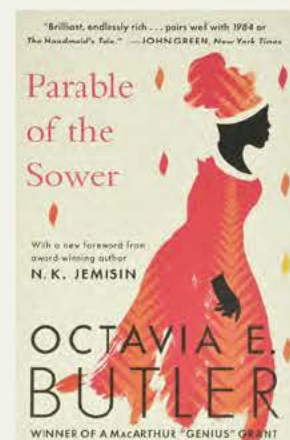
Featured Read for Parable Path Maine