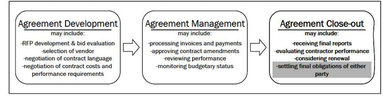
Figure 2. High-Level Overview of DHHS' Contracting Process with OPEGA's Focus Highlighted

When they end, agreements for human services undergo a close-out or final settlement process. This may include delivery of final reports required under the agreement terms and/or a financial settlement to ensure that the dollars paid during the agreement's life have been appropriate and allowable. Any remaining balances owed to either party should be resolved at this time. This financial settlement portion of the close-out phase was the focus of OPEGA's review.