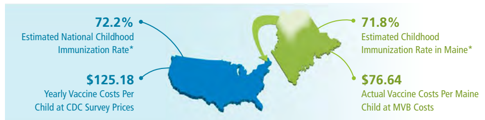
*2015 National Immunization Survey Childhood Report, published Oct. 2016

MaineHealth's Health Index website tracks improvement in childhood vaccination coverage, www.mainehealthindex.org .