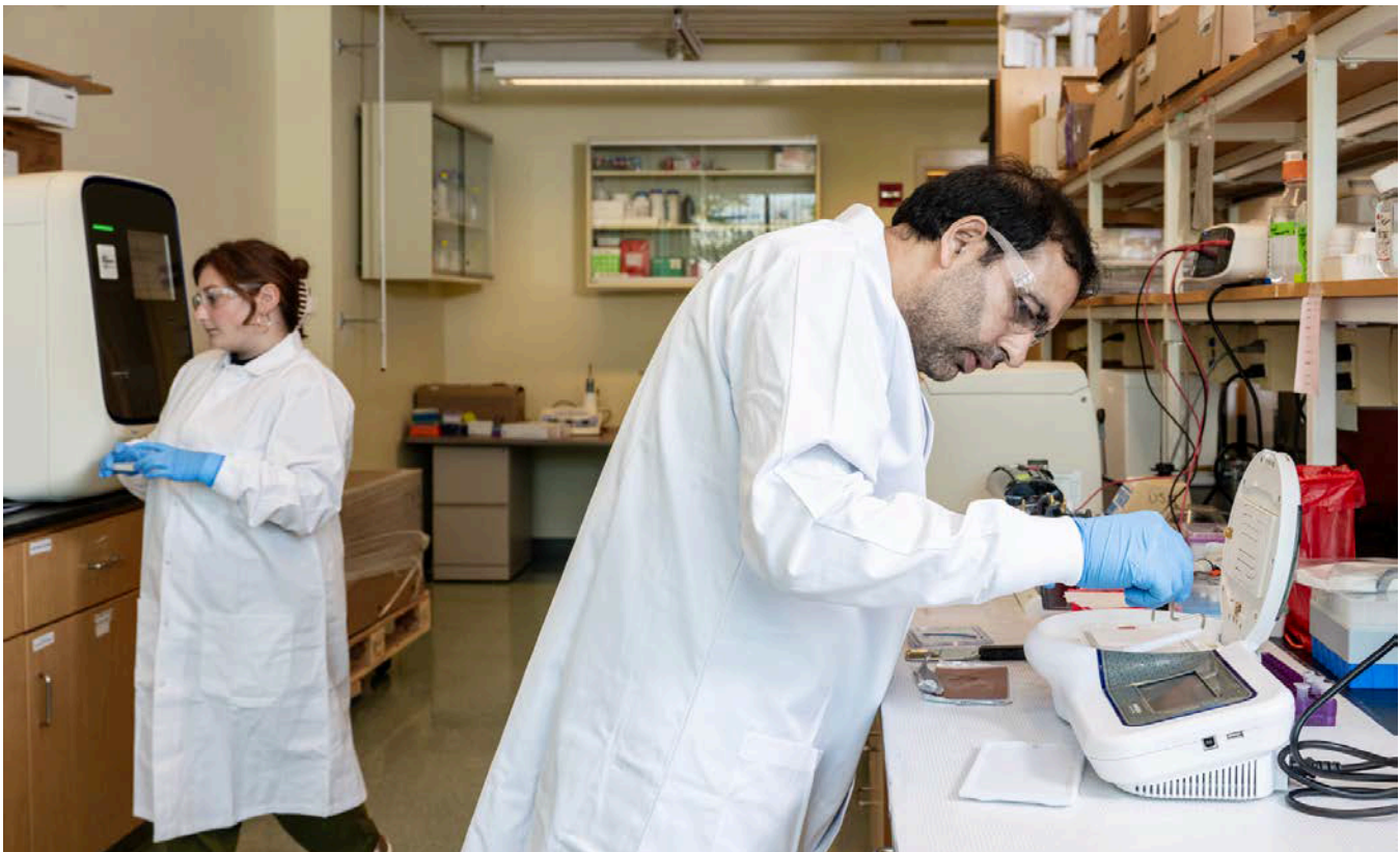
The Roux Institute and the University of Southern Maine host three life sciences companies in a shared BioPILOT scientific lab. The MJRP-funded Maine Life Sciences Incubator will expand access to spaces like this one for emerging companies in Maine's life sciences industry.

Maine's life sciences industry is one of the state's fastest-growing sectors. It accounts for nearly 10,000 good-paying jobs and $2.3 billion in economic activity, fueled by nearly 600 organizations spanning biotechnology, diagnostics and medical devices, marine and aquaculture science, health care innovation, and fields such as artificial intelligence (AI), data science, and bioinformatics.