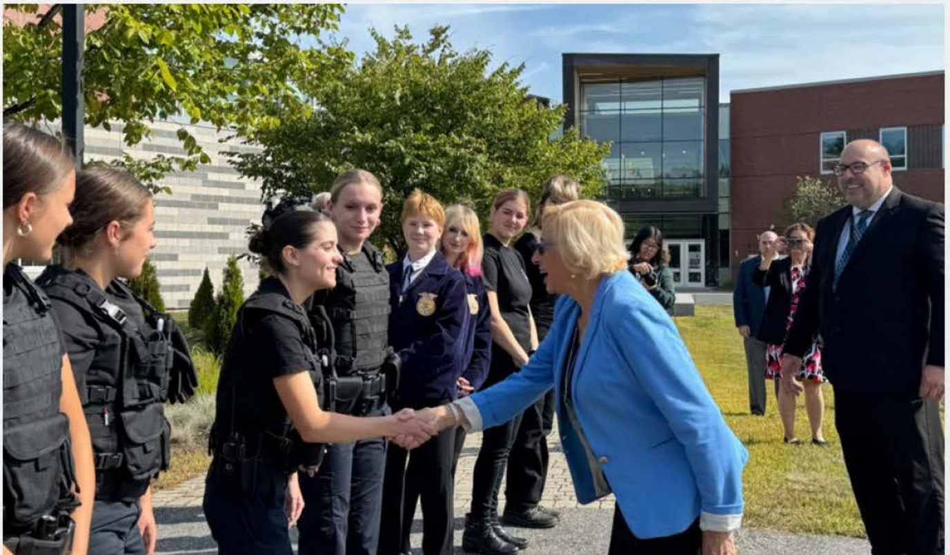
Governor Mills visits with students at Sanford Regional Technical Center, which received a grant of nearly $117,000 to purchase equipment for its Engineering Architectural Design and Machine Tool Programs in September 2025.

Maine needs more plumbers, electricians, builders, and trade professionals. Through the Maine Jobs & Recovery Plan, Maine has invested $20 million to expand career and technical education (CTE) across the State, including $4.5 million in awards to 23 CTE programs to purchase and upgrade equipment to enhance student learning experiences and career preparation for high-skilled, in-demand industries. Nearly 11,000 students, a record high, enrolled in CTE programs across the state this year.