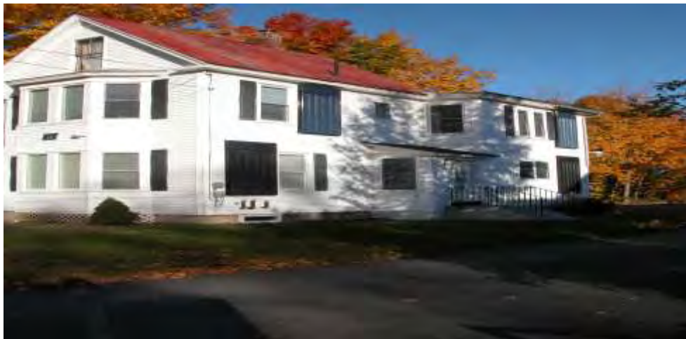
Solar thermal hot-air system, South Paris Maine