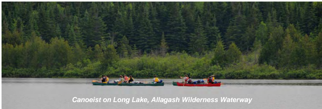
Canoeist on Long Lake, Allagash Wilderness Waterway

The commissioner shall report on or before March 1st of each year to the joint standing committee of the Legislature having jurisdiction over conservation matters regarding the state of the waterway, including its mission and goals, administration, education and interpretive programs, historic preservation efforts, visitor use and evaluation, ecological conditions and any natural character enhancements, general finances, income, expenditures and balance of the Allagash Wilderness Waterway Permanent Endowment Fund, the department's annual budget request for the waterway operation in the coming fiscal year and current challenges and prospects for the waterway.